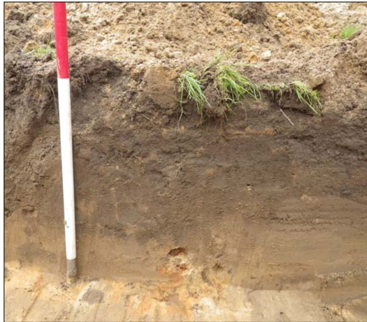
Plate 1. Stratigraphy as revealed by the evaluation trench