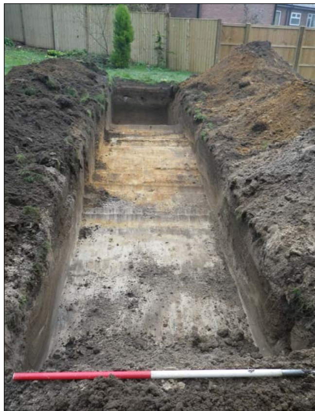
Plate 2. General view of the evaluation trench, looking south east