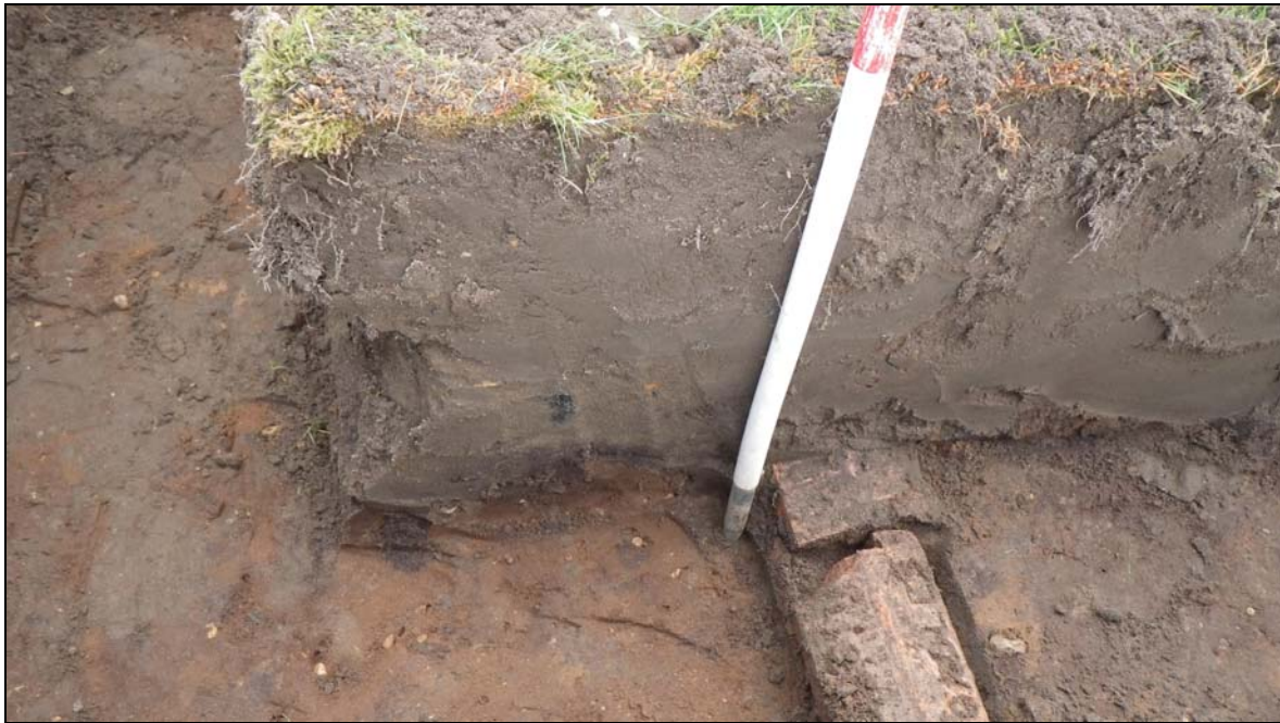
Plate 1. Representative section of footings (facing south-west, 1m scale)

Three modern foul/surface water drains were noted, as well as a small diameter metal service pipes (possibly old gas or oil pipes) in three locations. The side of a concrete slab was encountered along the northern edge of the footing trench, at a depth of c. 0.5m, visible for at least 7.3m and continuing past the footing at each end.