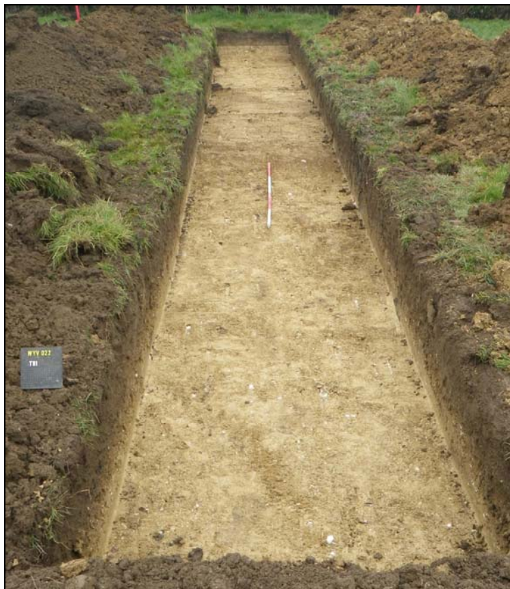
Plate 1. Trench 1 facing north (2m scale)

Three glacial stripes were noted, on a general north-west/south-east alignment, and a single modern field drain cut was seen, cut through the subsoil, on a north-northwest/south-southeast angle.