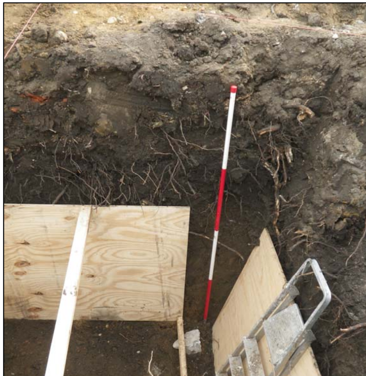
Plate 1. The southeastern pad excavation showing the depth of the large pit (scale = 2m).

The foundation design was changed to comprise two large pads, 2m by 2.5m, to be connected by steel and concrete beams. A second visit was made on 20th March to monitor the excavation of these. The previously identified disturbance appeared to comprise a large backfilled pit or quarry running roughly north to south c. 2.5m to the east of the existing house. It was filled with dark sandy loam with fragments of post-medieval brick and tile towards the top (plate 1). The eastern edge of this pit lay beyond the extent of the excavations. The depth of the pit was 2.3m with a truncated natural subsoil of yellow silty sand at the base. Adjacent to the house the natural subsoil consisted of a yellow silty clay and was located at a depth of c. 1m below a mass of dark brown topsoil. No archaeological features were identified and no pre-modern artefacts were recovered during either monitoring visit.