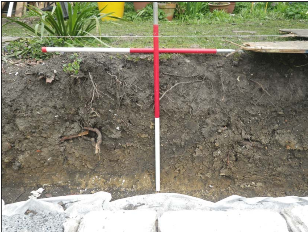
Plate 1. Stratigraphy as revealed by the footing trench at the rear of the extension camera facing northeast

Note: this extension to the main house followed the construction of a double garage, the groundwork of which was archaeologically monitored under the same archaeological brief. The results, which were similar, are the subject of an earlier report (SCCAS Report No. 2013/145).