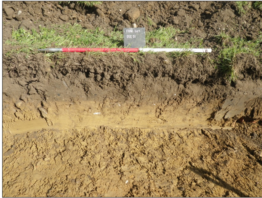
Plate 1. Sample section (1m scale facing north-west).