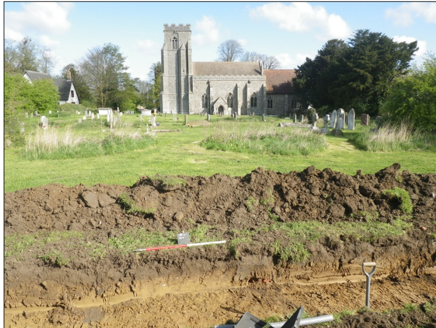
Plate 2. Trench location with reference to St Peter's church (1m scale, facing north-west).