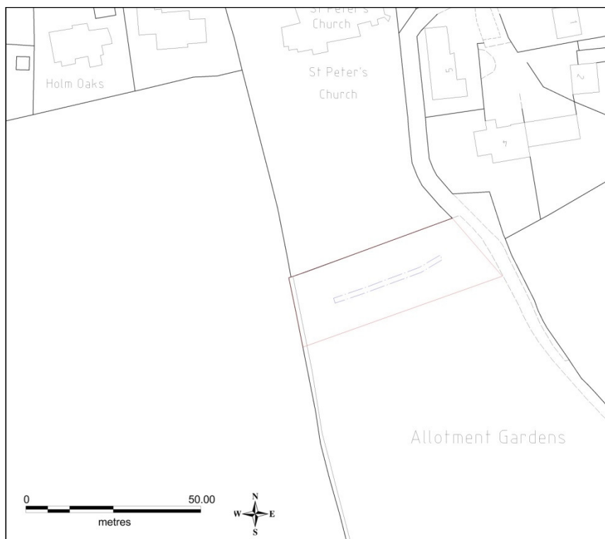
Figure 2. Trench plan with development area (red).