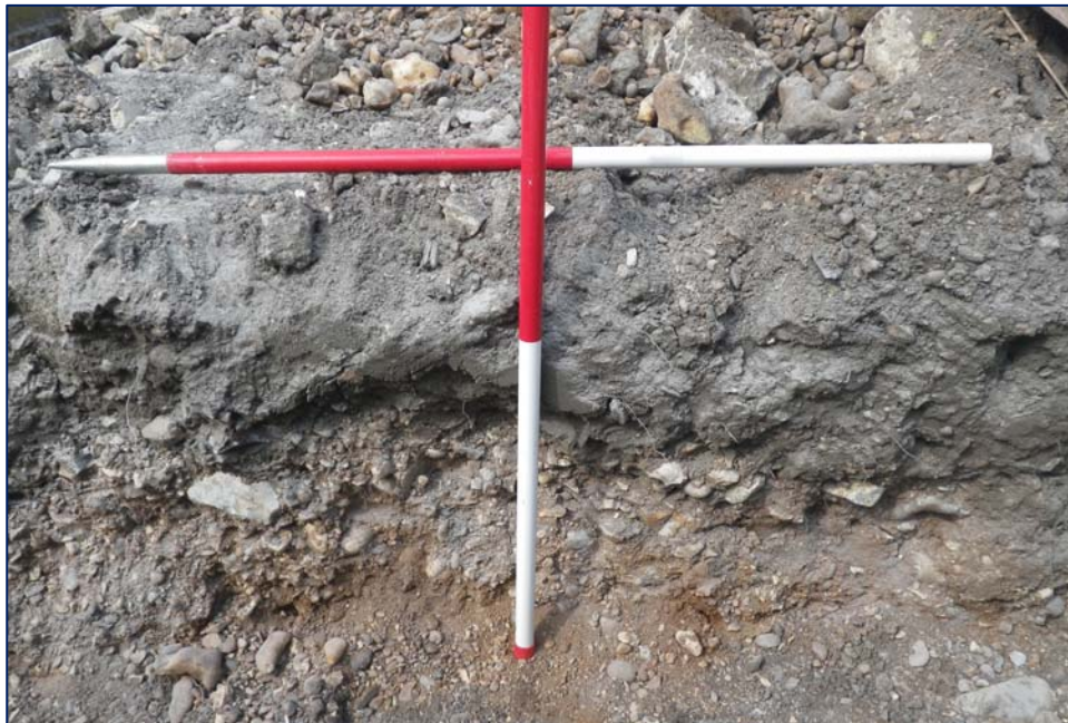
Plate 1. The revealed stratigraphy (scale = 1m in 0.5m divisions)

Some of the spoil had been off-sited although a large proportion was still present. This was examined but, other than 20th century debris, no finds were identified.