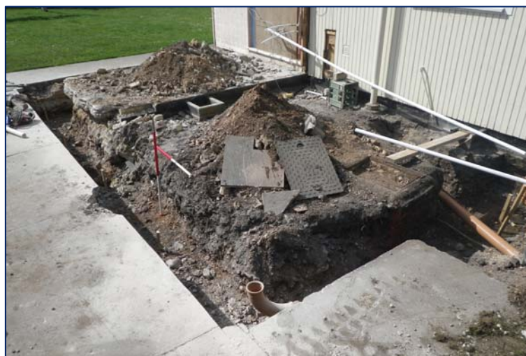
Plate 2. General view of the excavated footings.