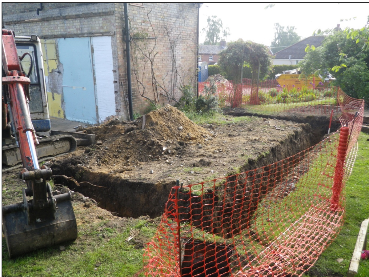
Plate 1. Footings trench mid excavation, looking east.