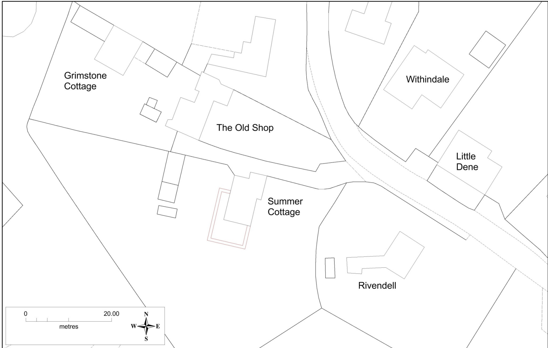
Fig. 2. Site plan (Footings trench in red).