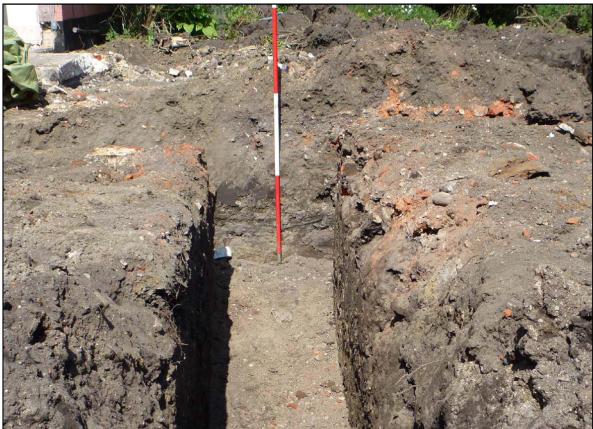
Plate 1. Stratigraphy as revealed by the footing trench at the rear of the extension camera facing north

The overburden consisted of dark topsoil with occasional lenses of yellow sand and fragments of red brick and tile, presumably relating to a group of recently demolished structures that formerly stood to the rear of the house.