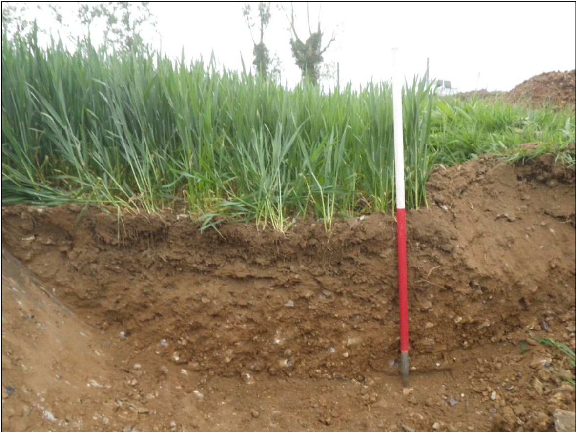
West facing section of trench showing topsoil over natural geology.

To enable the addition of a passing place to an existing farm track a small parcel of land in cultivation was removed. This extended 2m to the north of the track and measured 32m from west to east. The topsoil, a dry and very stony mid greyish brown sandy silt, was removed to expose the natural geology beneath. This was a mid orange/brown dry sand with frequent small and medium angular, sub-angular and rounded stones. The topsoil was between 0.3m and 0.4m thick. No archaeological features were revealed and no artefacts recovered.