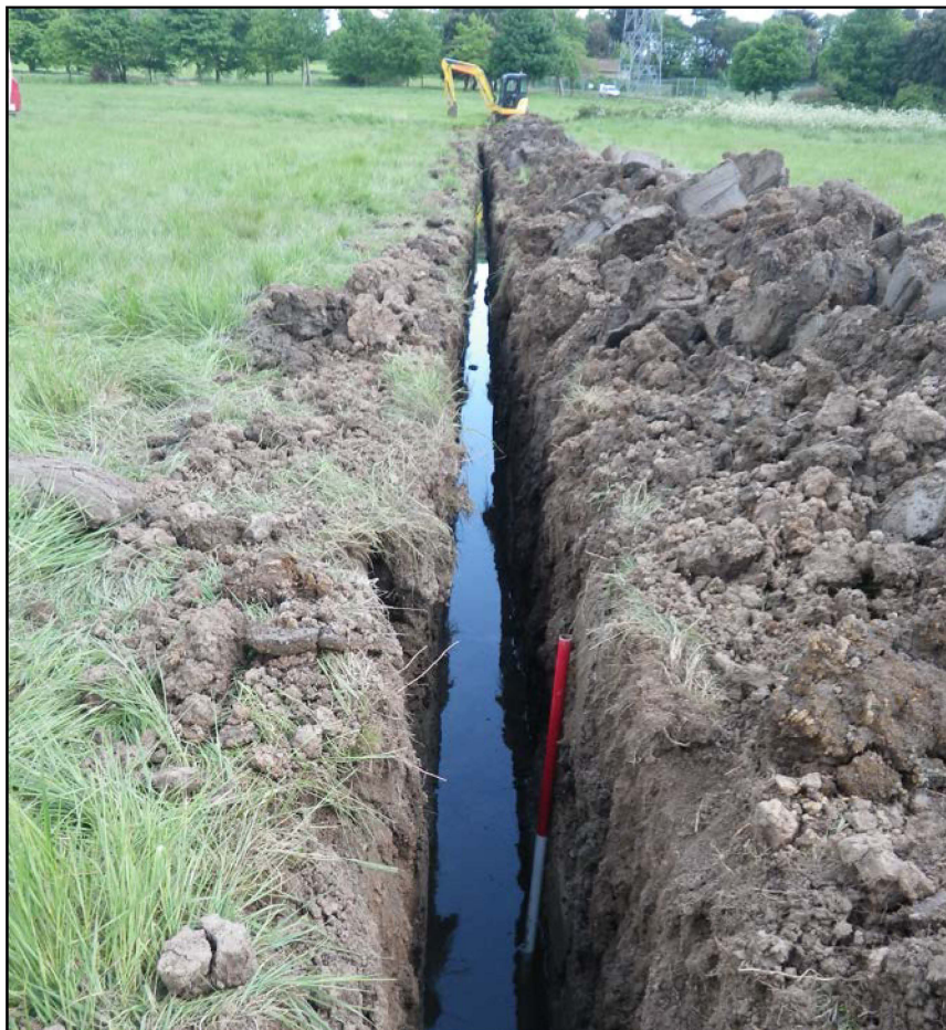
Plate 1. General view of the cable trench, camera facing southeast

The entire route of the cable was examined but no features of historic significance were identified. The spoil was placed alongside the trench and this was visually examined for artefacts but none were seen.