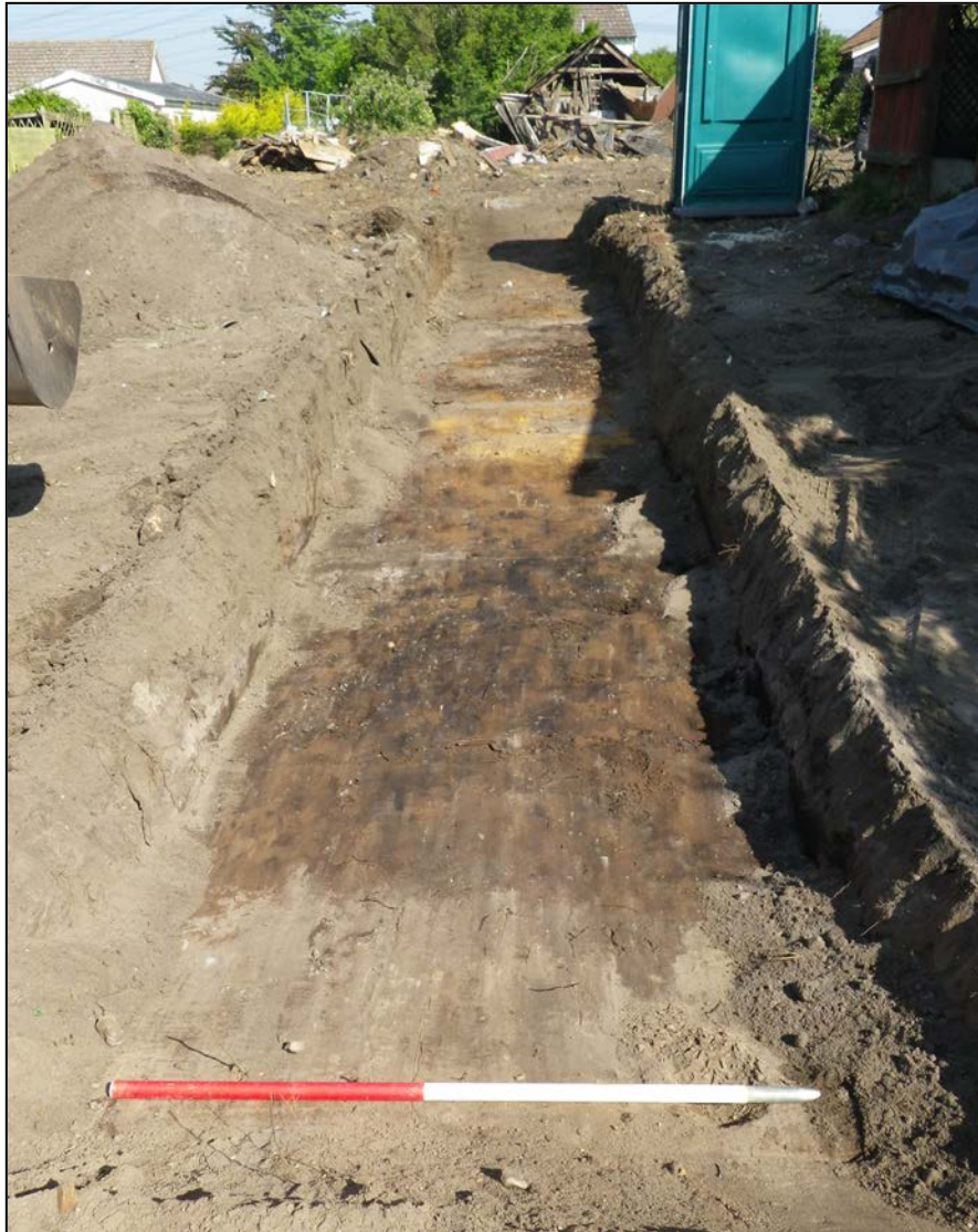
Plate 1. General view of the evaluation trench, looking NNW