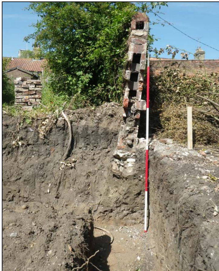
Plate 1. View of the eastern corner of the footing trench showing the recorded stratigraphy and the variation in land levels on either side of the southeastern boundary

No significant archaeological deposits or features were identified.