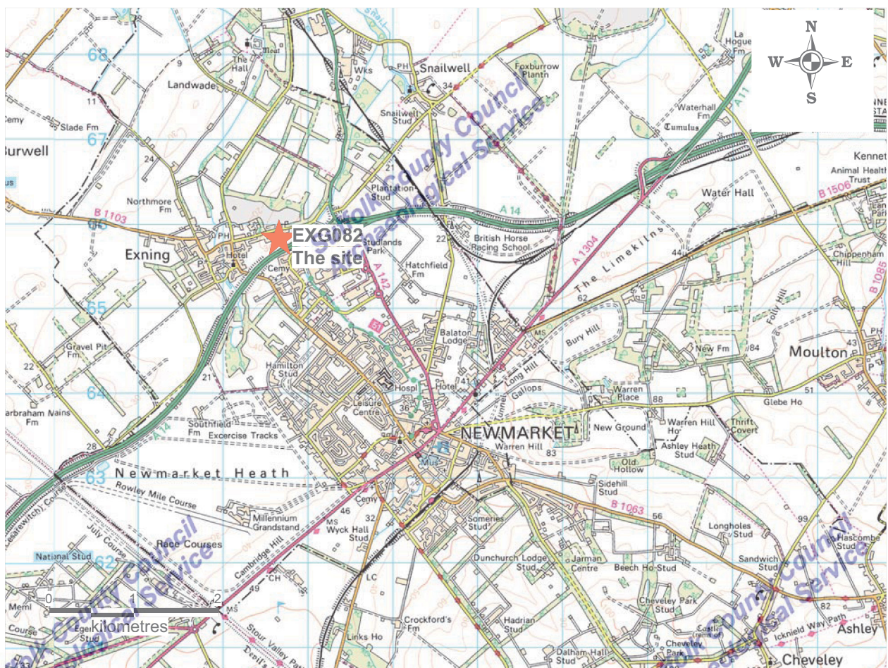
Figure 1. Site location

The aim of the evaluation was to establish the nature of any archaeological deposits, specifically to establish the presence or absence of Anglo-Saxon burials, and to provide sufficient information to enable the production of a mitigation strategy for any deposits threatened with damage by the development.