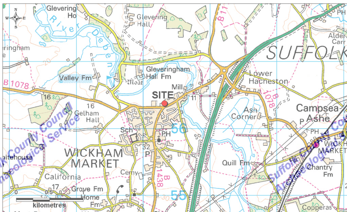
Figure 1: Site location

Planning consent for the construction of a new industrial unit to the rear of Roland Plastics in High Street, Wickham Market, required a programme of archaeological monitoring to be undertaken. The proposal is adjacent to a findspot of Roman and medieval pottery found during 2000. Roland Plastics commissioned the project.