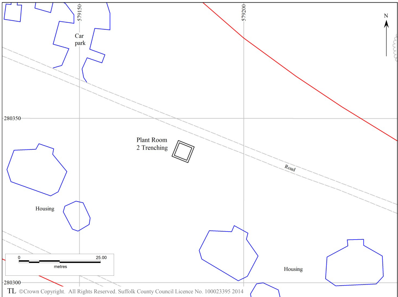
Figure 2. Plant Room 2 trenching, site outline (red) and development outlines (blue)