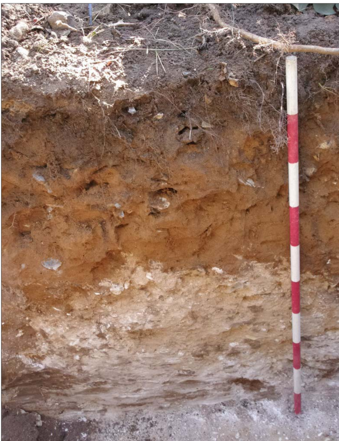
Plate 1. Soil profile, 1m scale, facing south-east