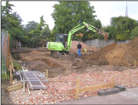
Plate I: works underway (12-6-07)