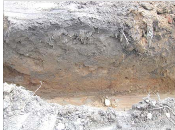
Plate II: sample of revealed soil profile