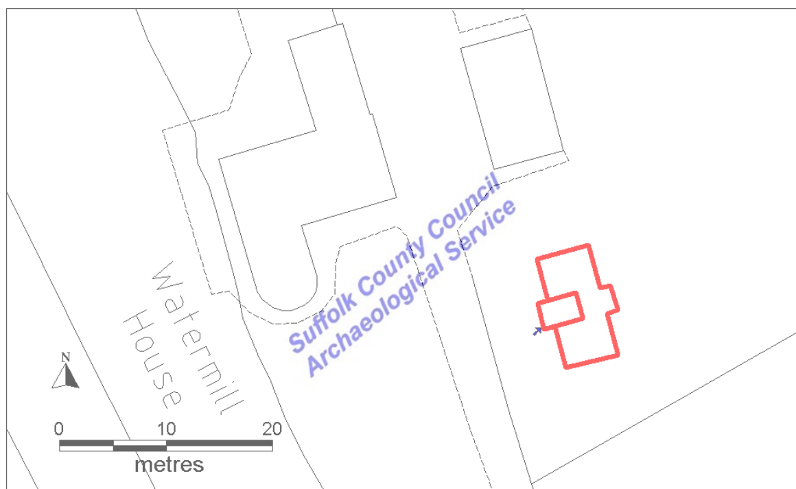
Figure 2. Plan locating the observed trenches (red) and showing the position of the photograph shown in Figure 3 (arrowed)

Observations were recorded in a field notebook and all salient information is contained in this report. Additional site photographs can be found in the SCCAS computer database at Ipswich, referenced by the site code KBU 016.