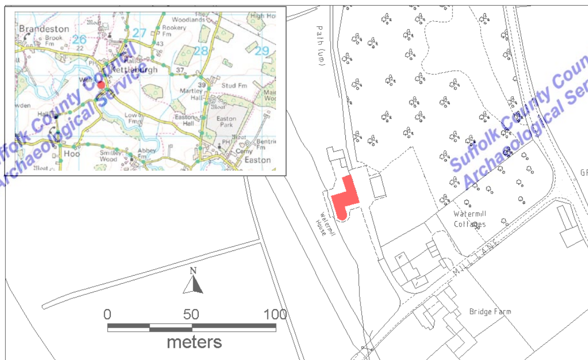
Figure 1. Maps showing the location of Watermill House, Mill Lane, Kettleburgh

© Crown Copyright. All rights reserved. Suffolk County Council. Licence No. 100023395 2007