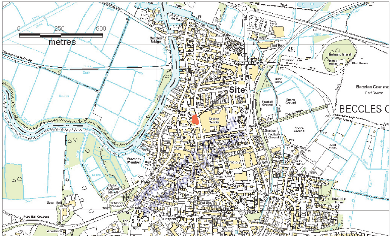
Figure 1. Site location

A Planning Application (W/2614/7) has been granted for the construction of three retail units and the remodelling/demolition of some existing buildings on land at the junction of Newgate and Manor House Lane in Beccles. The site is centred on approximately TM 4224 9053 and covers c. 2000m 2 . However, the multi-stage nature of the work means that this first stage of evaluation was only concerned with the courtyard area (indicated in Figure 2), which was rather smaller at c. 500m 2 . The site stands at approximately 11m AOD on land that slopes gently to the east.