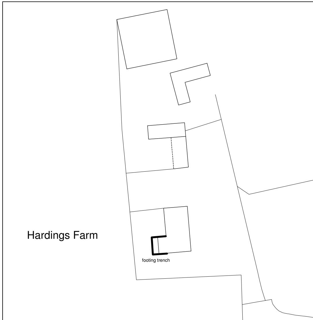
Figure 2. Site plan

was 50cm of a homogenous, well worked, fine peaty sand at the northern end of the trench, deepening to 70cm at the south. This lay directly over the yellow sand of underlying geology. Fragments of brick and pantile were observed within the spoil, the quantities were very low and all were post-medieval in date.