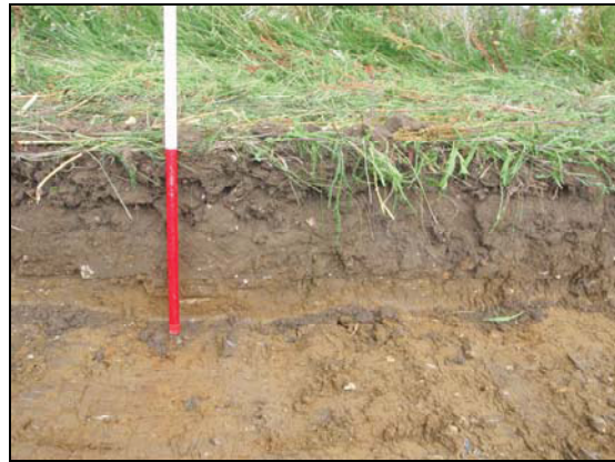
Plate II: view of soil profile