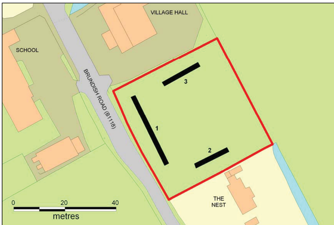
Figure 2: Trench Plan

The surface of the subsoil was examined for cut features but none were identified. The machining was closely observed throughout in order to maximise the recovery finds but no artefacts were noted in any of the trenches and no finds were recovered from the spoil. A systematic metal detecting survey of the trenches and the spoil was also undertaken but without positive results.