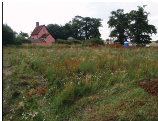
Plate III: general view of development area with 'The Nest' beyond

Any opinions expressed in this report about the need for further archaeological work are those of the Field Projects Team alone. The need for further work will be determined by the Local Planning Authority and its archaeological advisors. Suffolk County Council's archaeological contracting service cannot accept responsibility for inconvenience caused to clients should the Planning Authority take a different view to that expressed in the report.