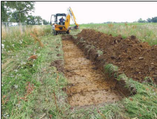
Plate I: Trench 3