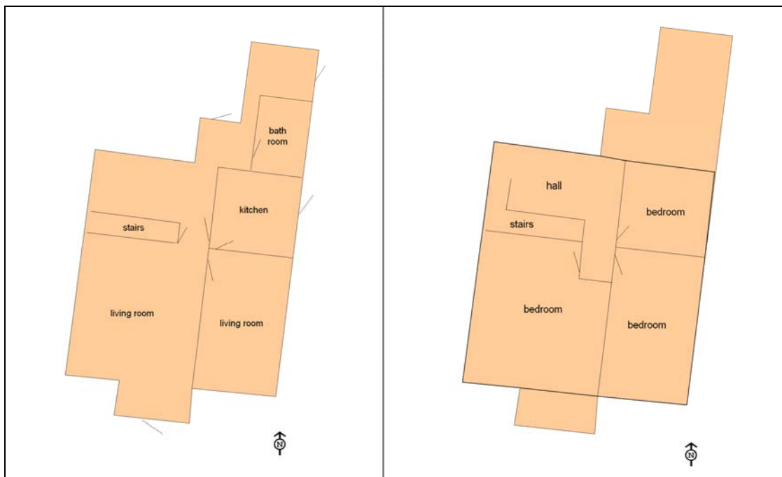
Figure 4: Plan of ground (left) and upper (right) floors of 'Brickfields'