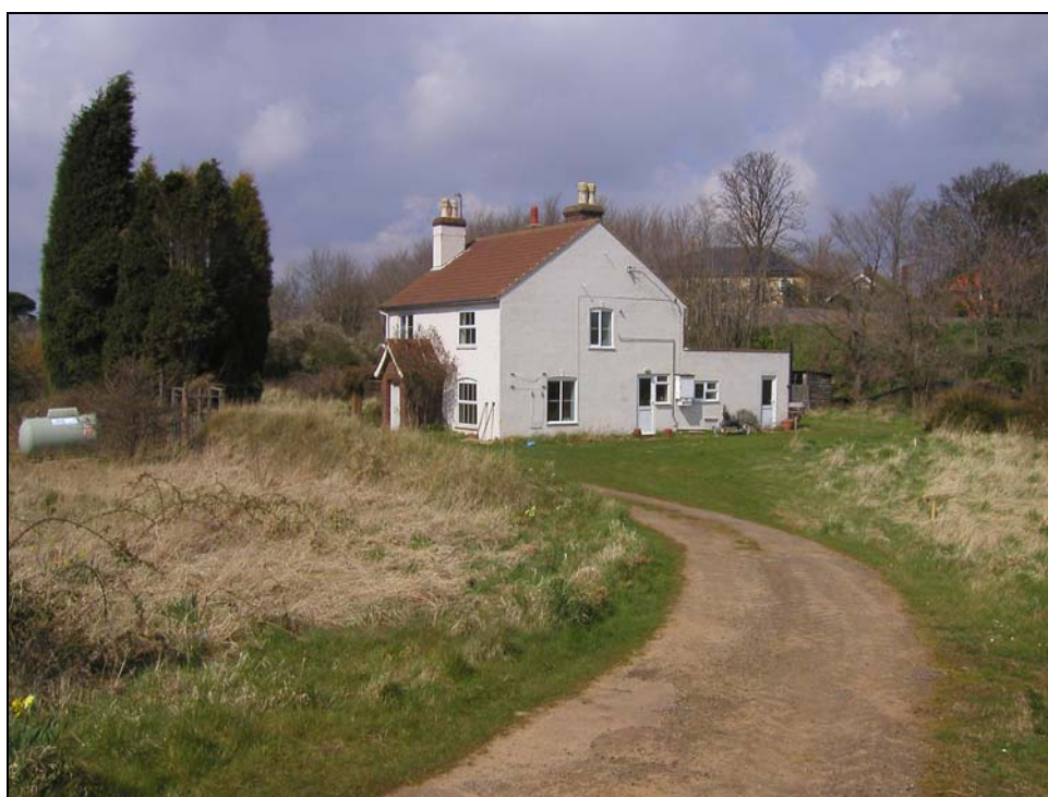
‘Brickfields’ (viewed from southeast)