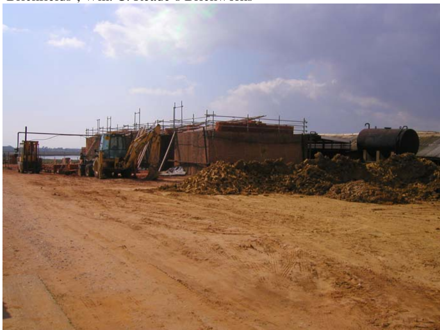
kilns (FXU 51)