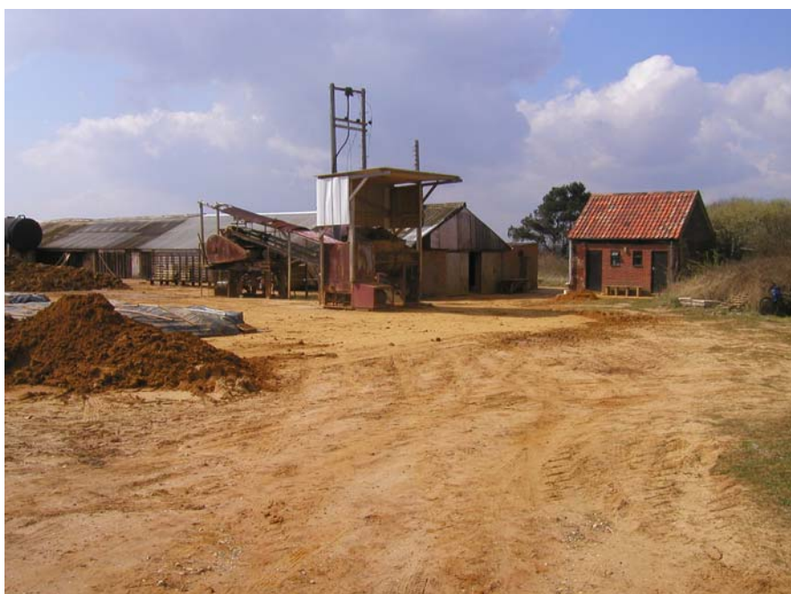
general view (FXU 52)