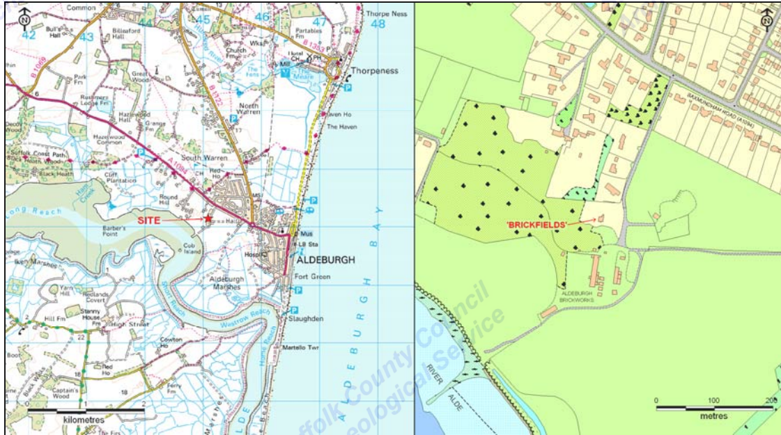
Figure 1: Location Plan

Summary: A basic photographic survey of a domestic residence known as 'Brickfields', Saxmundham Road, Aldeburgh, was undertaken in April 2008 prior to its demolition. The house was constructed between 1880 and 1900 and is believed to have been built for the manager/foreman of a nearby brickworks. The survey comprises general shots of all major external elevations, a small number of internal pictures and a plan of the interior layout based on a sketch. The site of the brickworks, including this house, is recorded in the County HER under the reference ADB 021. The survey was undertaken by the Suffolk County Council Archaeological Service Field Team who were commissioned and funded by MS Oakes Ltd, building contractors, acting on behalf of their client.