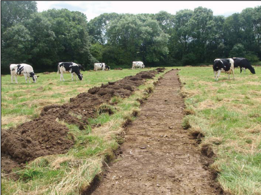
Plate II. view southwest along Trench 5