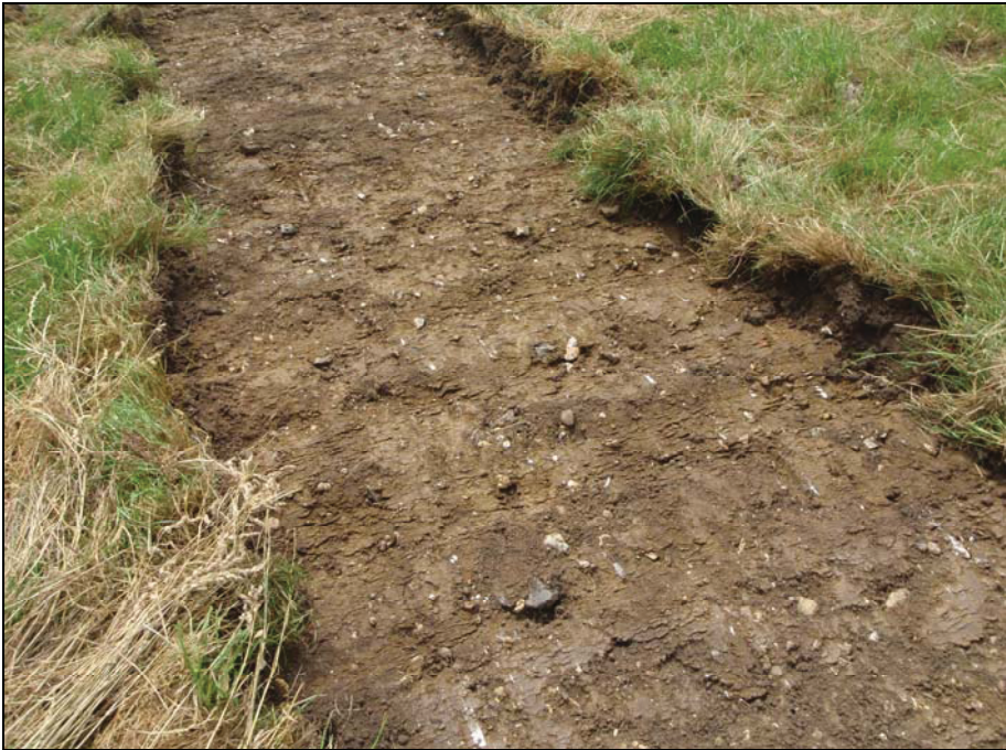
Plate I. natural subsoil at base of trench