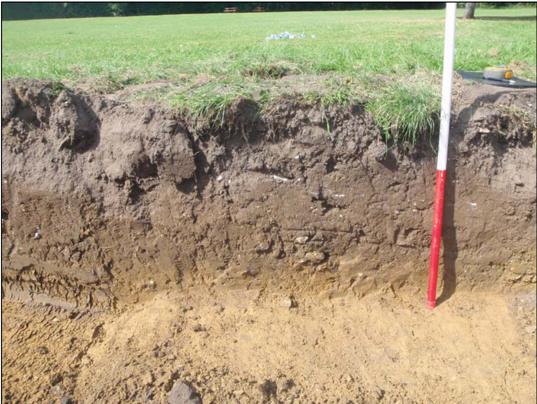
Plate I. soil profile as revealed in western face of the trench (ref. GDA 41)