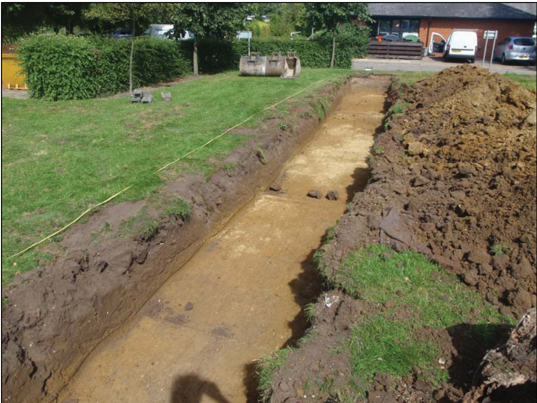
Plate II. view of the trench looking north (ref. GDA 40)