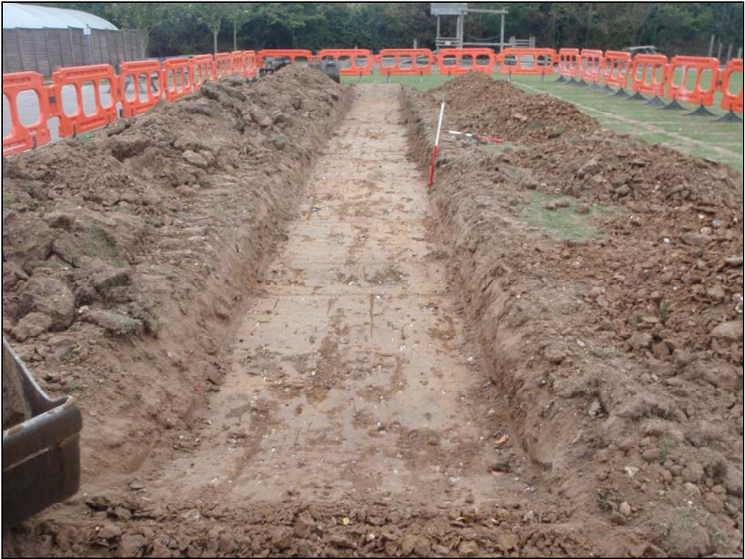
Plate II. View of the trench looking northwest (ref. GEQ 14)