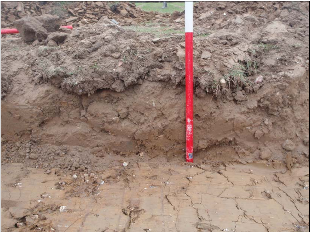
Plate I. Soil profile as revealed in northeastern face of the trench (ref. GEQ 12)