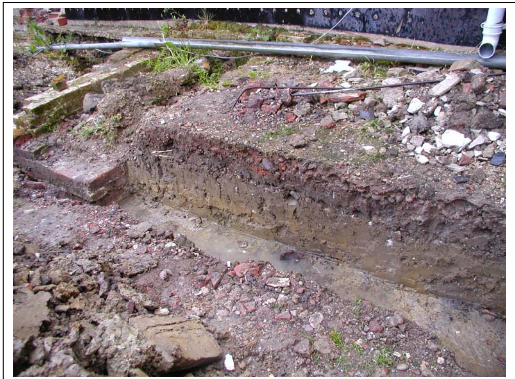
Plate 1: View of the excavated footing trench

Linzi Everett Field Projects Team, Suffolk County Council Archaeological Service. June 2005.