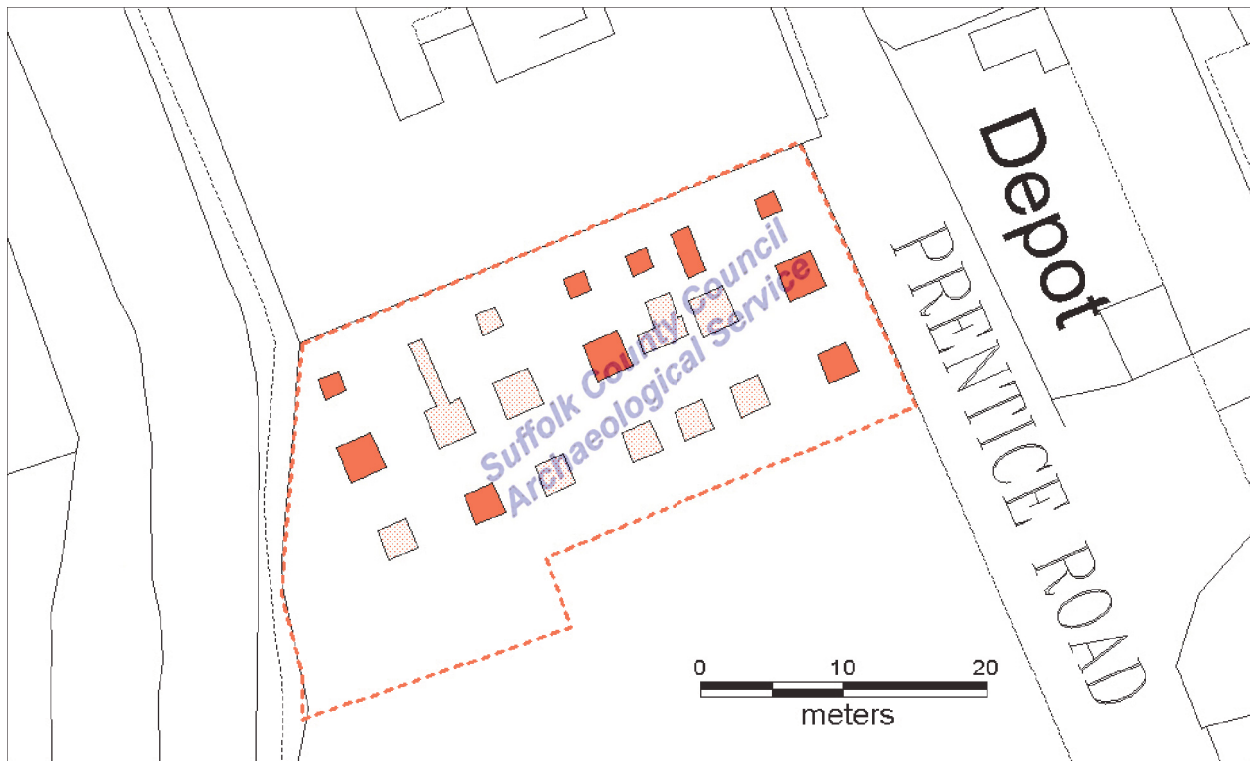
Figure 2. Position of pile caps (solid red indicates those monitored)

The site was allocated the SMR number SKT 039 and observed archaeological features and deposits were allocated OP (observable phenomena) numbers and recorded on pro forma context sheets.