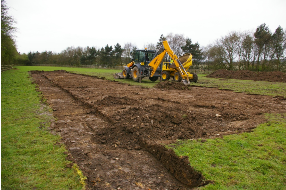
Figure 3 Proposed development area, work in progress (looking south-west).