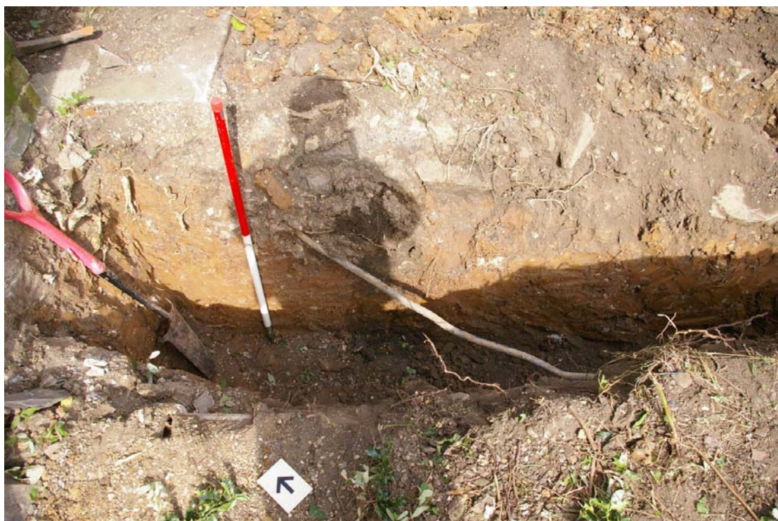
Figure 3 Representative section in northernmost trench (looking north east).