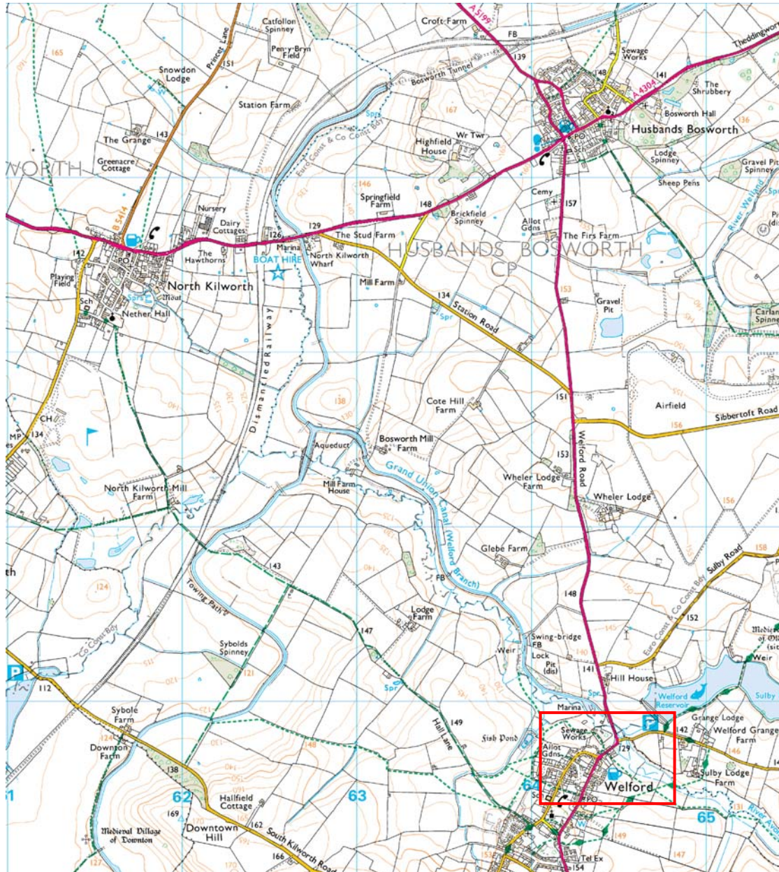
Figure 1. Site location

buried archaeological remains. In view of this a programme of archaeological attendance was approved. This consisted of a watching brief carried out during the groundworks undertaken by the client's contractors. This work followed Planning Policy Statement 5 ( Planning and the Historic Environment ) (Department for Communities and Local Government March 2010).