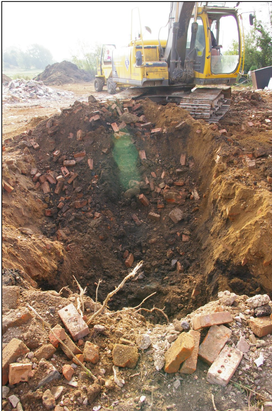
Figure 3 Extent of modern disturbance visible in grubbing out trenches.