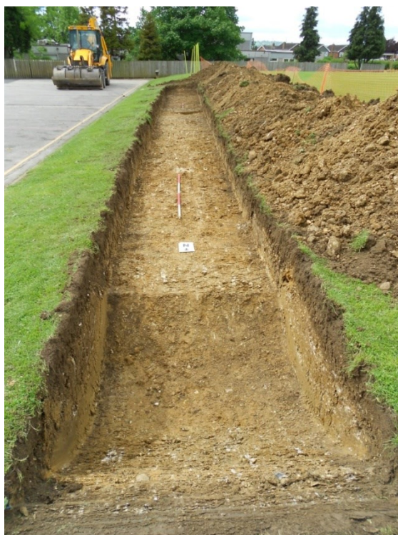
Figure 3: Trench viewed south; 2m scales

The single evaluation trench, aligned broadly north-south, measured 20m long, 1.60m wide and between 0.45m and 0.75m deep. Mechanical removal of 0.15m-0.20m of