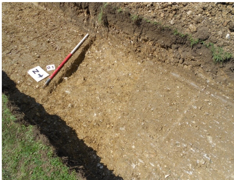
Figure 5: Plough furrow [01] view southwest; 1m scale