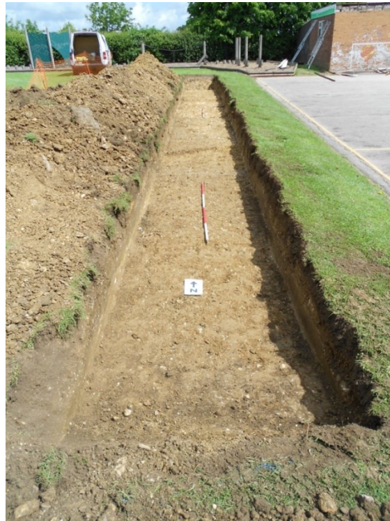
Figure 4: Trench viewed north; 2m scales

turf and dark grey clay loam topsoil and 0.30m-0.40m of pale grey/brown silty clay subsoil revealed compact, plastic pale dull orange/brown silty clay with c. 30% limestone fragment content and sparse flint. The trench was devoid of archaeological features or artefacts with the sole exception of a probable plough furrow (Figure 5), observed traversing the trench on a broad northeast-southwest alignment around 1m south of the southern end of the trench. The heavily truncated feature measured 1.30m+ wide and 0.10m deep, its pale grey-brown clay silt fill producing three pottery sherds of probable 19th century date. The shallow nature of the feature suggests truncation of the area, either as a result of modern agricultural practice or during construction of the school.