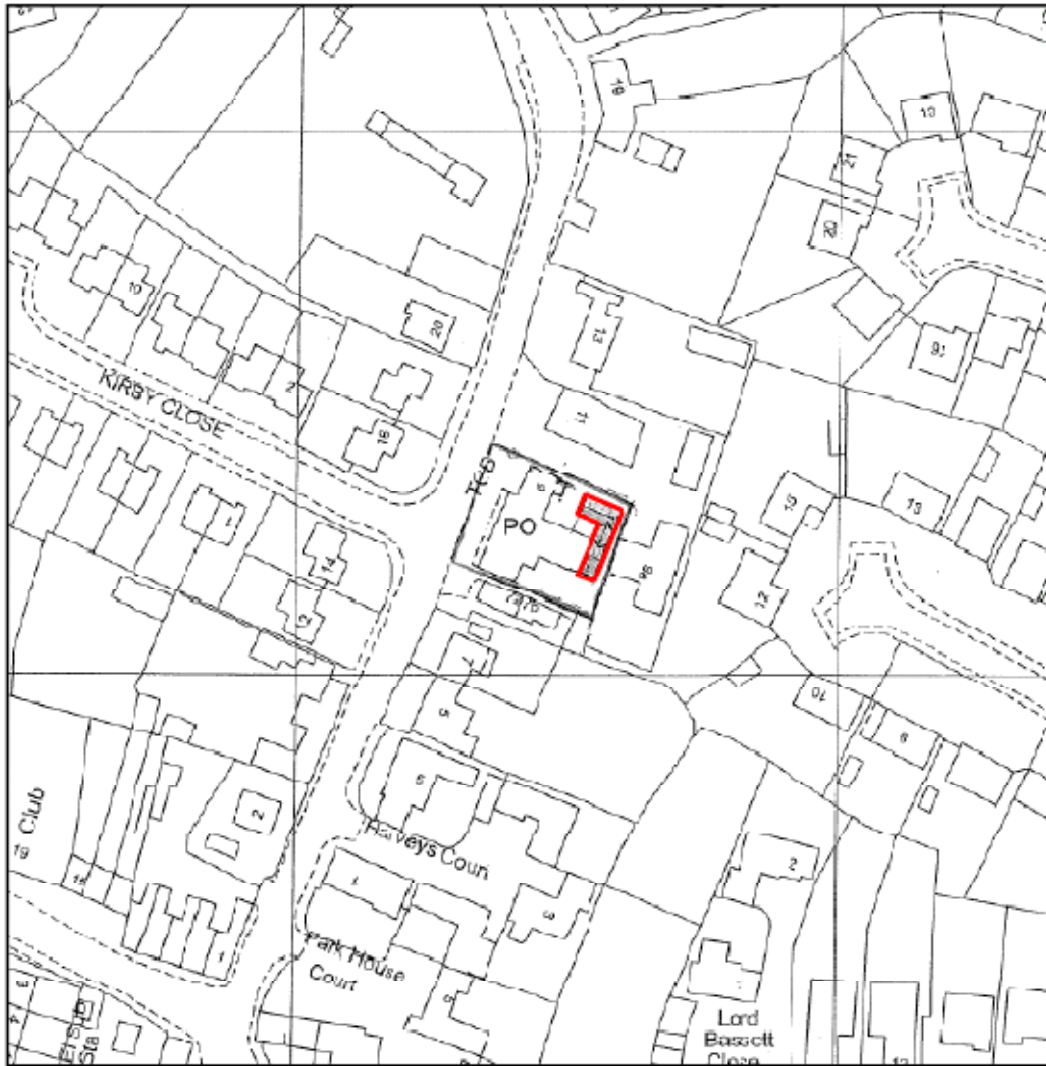
Figure 2 Area of archaeological watching brief (in red). (Not to Scale)