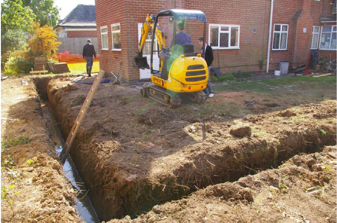
Figure 3 Work in progress (looking south west).