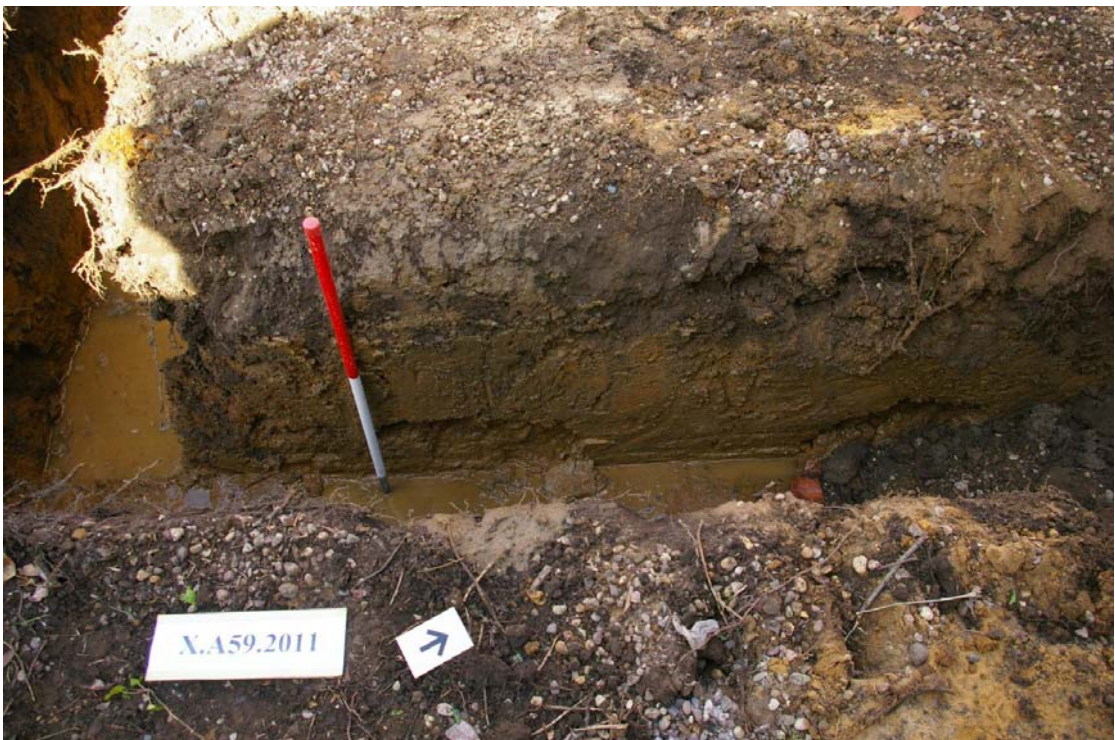
Figure 4 East-south east facing section (southern end).