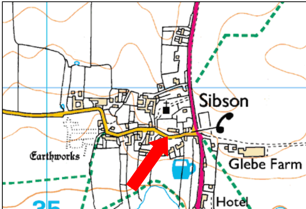
Figure 2 Sibson village core showing proposed development area. (1:25000).

All groundworks were carried out by a 1.5 tonne mini digger fitted with a ditching bucket and a toothed bucket under continuous archaeological supervision. The exposed substratum was observed and the spoil searched for finds. The watching brief took place on November 30th 2011.