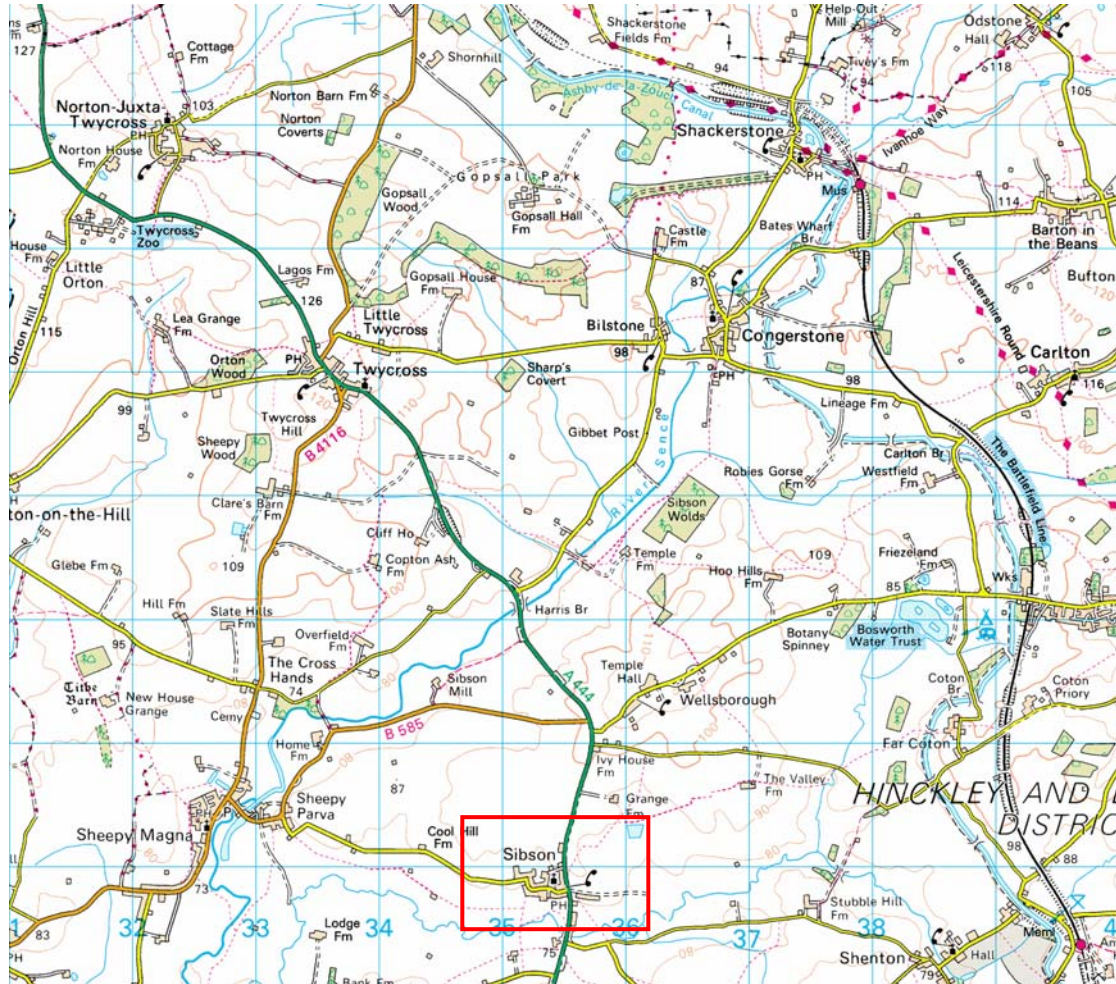
Figure 1. Site location (1:50,000)

upon buried archaeological remains. In view of this a programme of archaeological attendance was approved. This consisted of a watching brief carried out during the groundworks undertaken by the client's contractors. This work followed Planning Policy Statement 5 ( Planning and the Historic Environment ) (Department for Communities and Local Government March 2010).