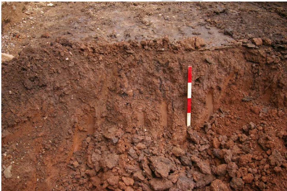
Figure 4 Exposed strata below floor slab.