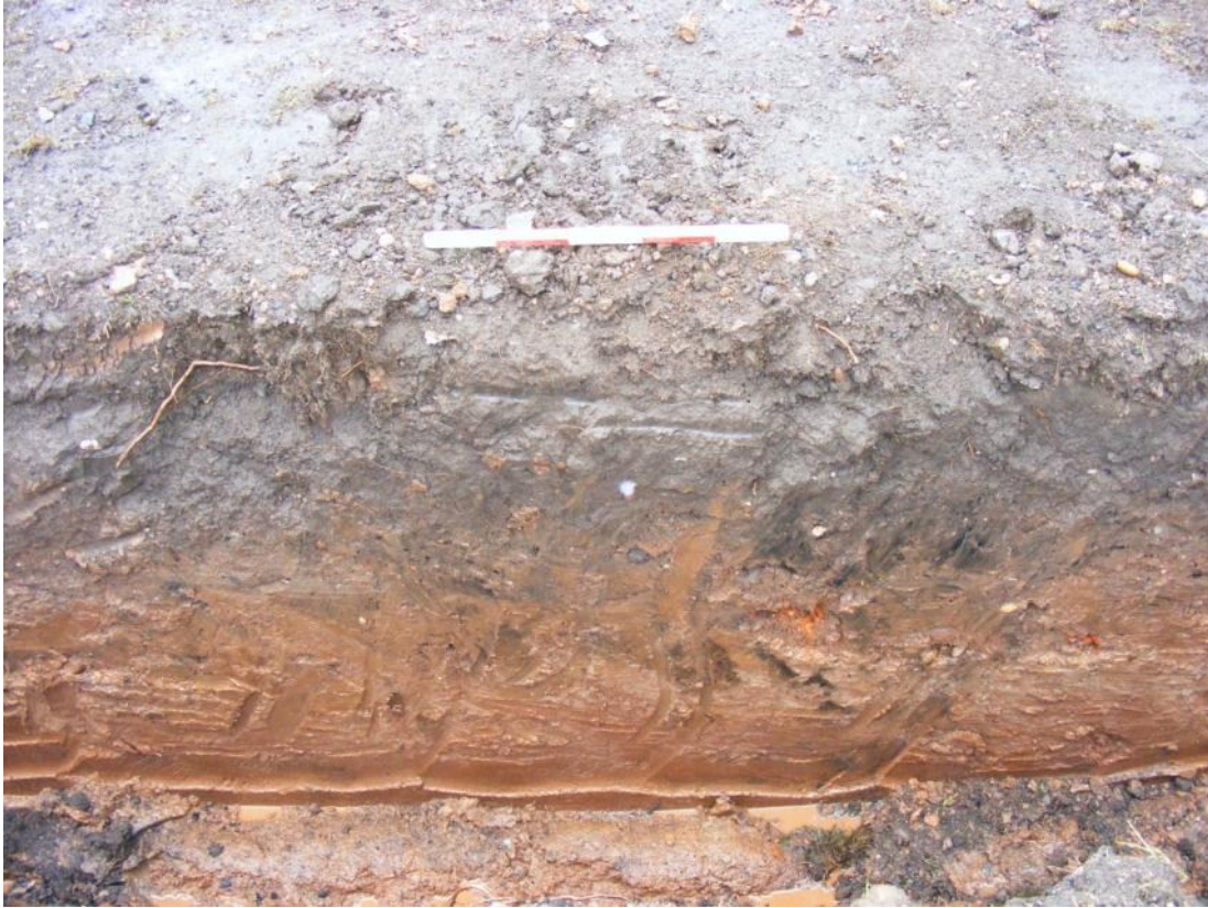
Figure 4: Section of footing at the rear of plot (north end), showing thicker overburden. Looking north.