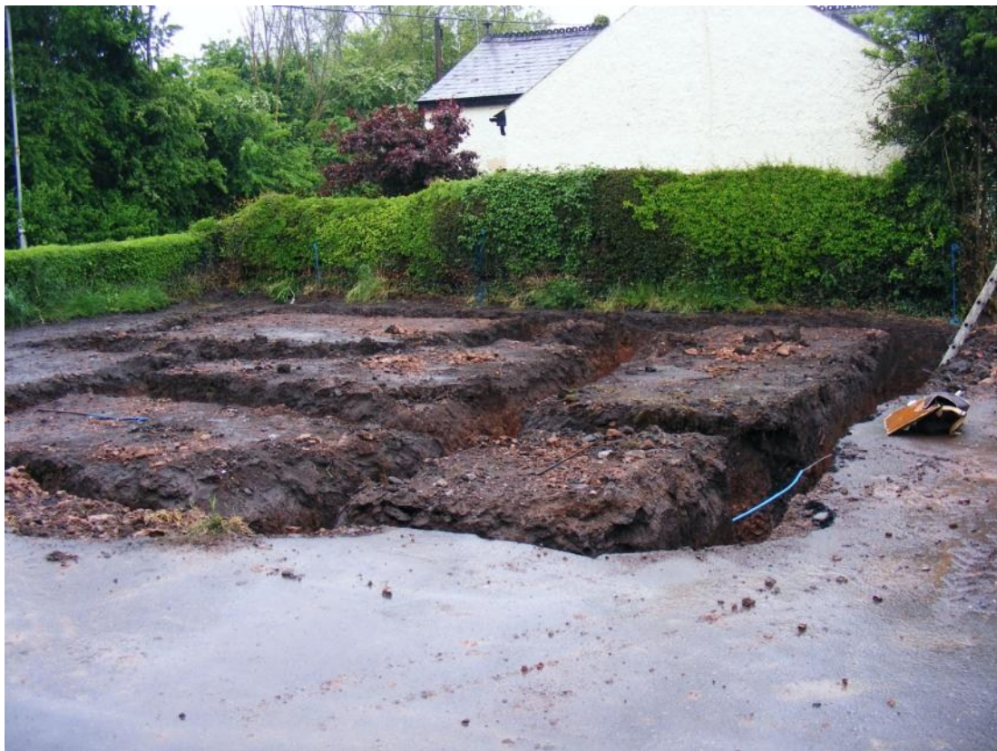
Figure 3: View over footings, looking west from driveway. Note former Wesleyan Chapel in background