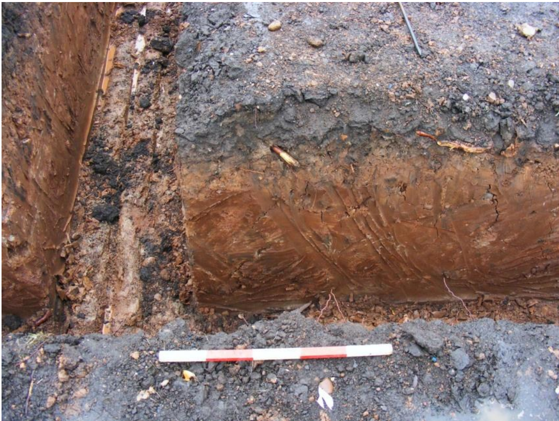
Figure 5: Section at the south end of the house footprint, showing thinner overburden and root disturbance, looking north