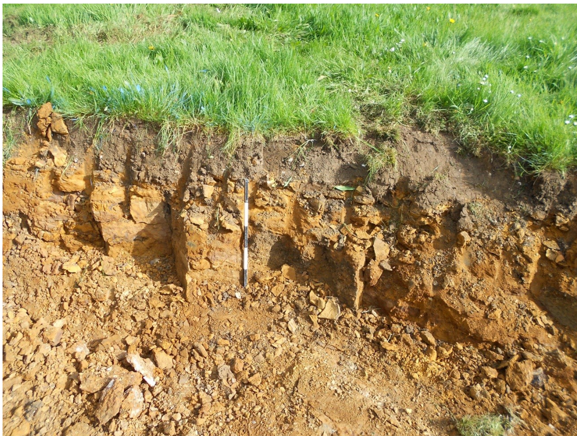
Figure 4: Section along northern edge of development area. Looking north