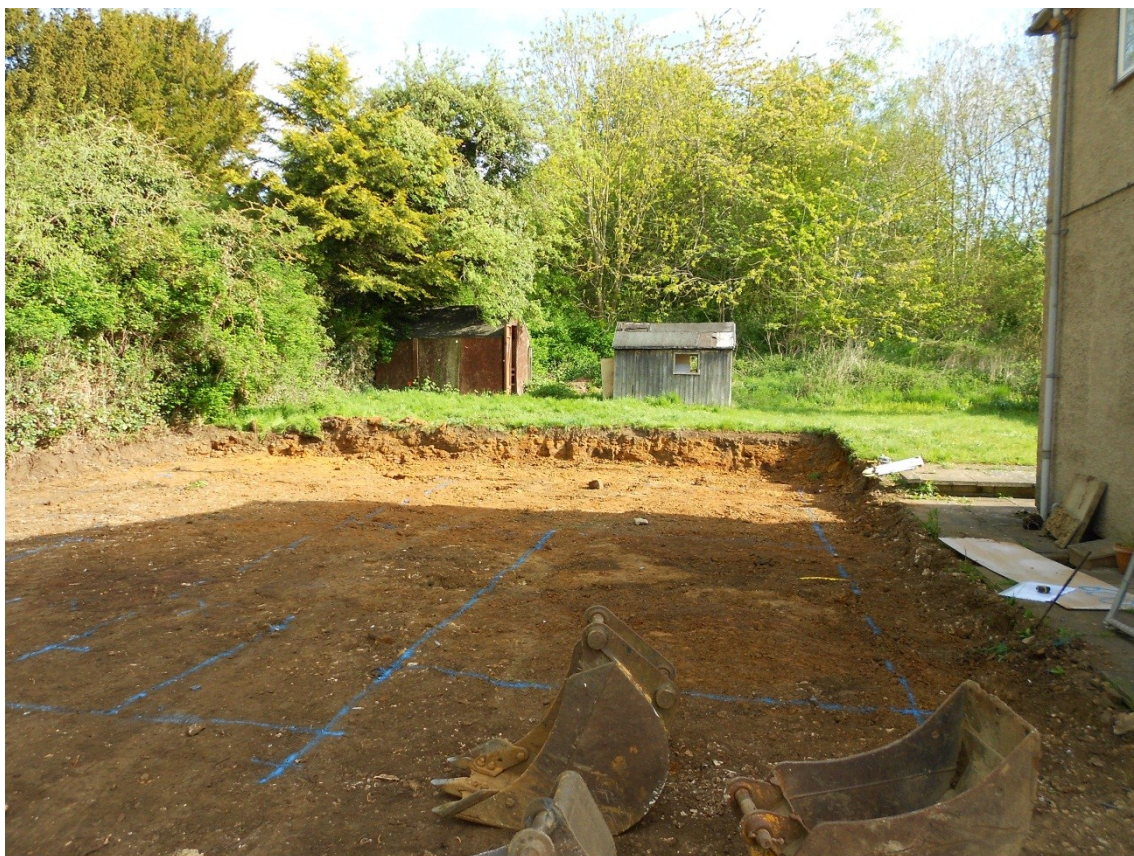
Figure 3: General view of site before excavation of foundation trenches. Looking north