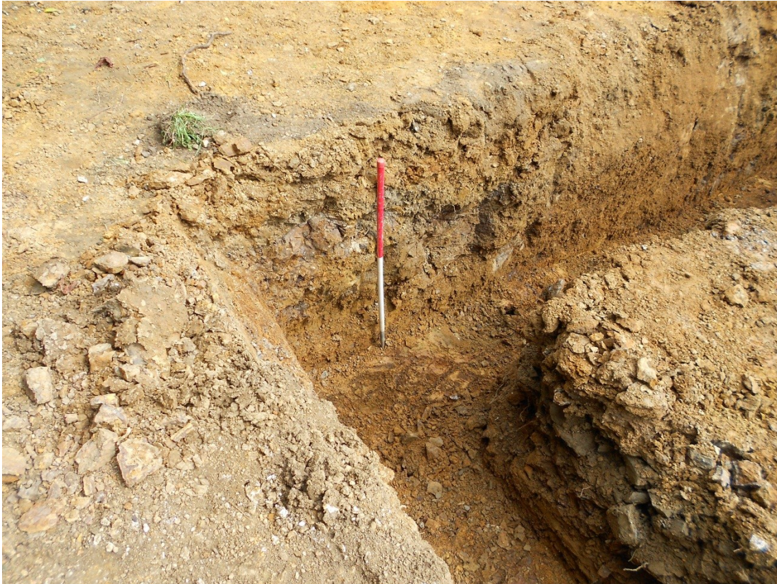
Figure 5: Typical dug foundation trench. Looking north-east.