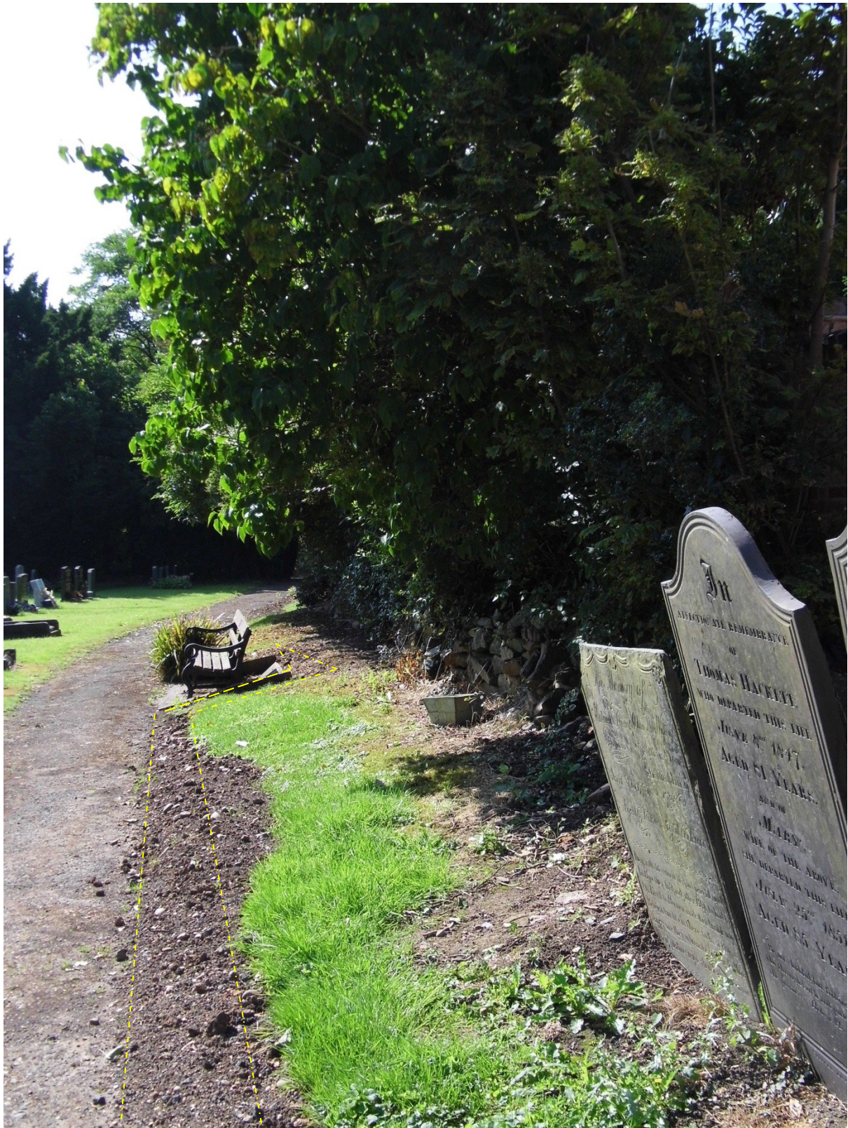
Figure 5. Location of trench