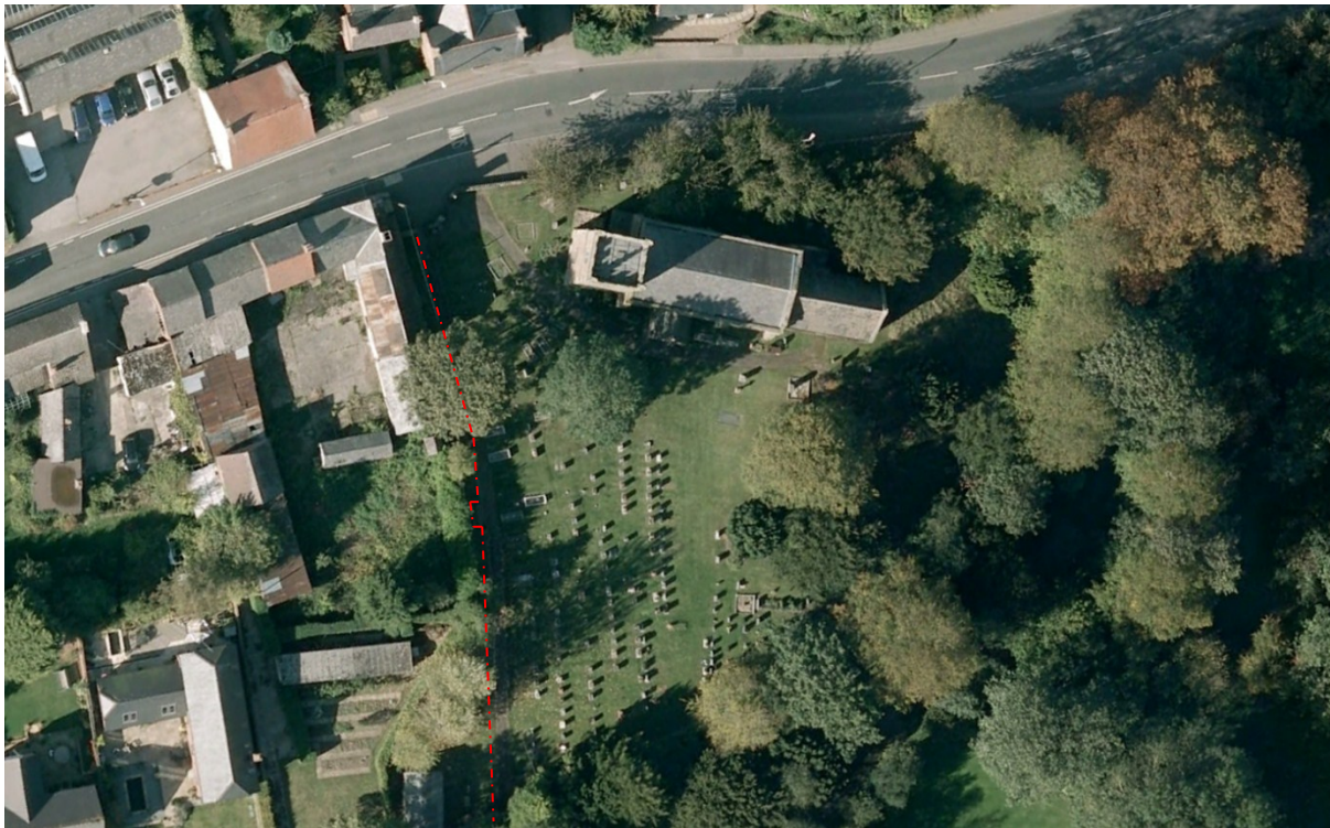
Figure 2. Location of the proposed development

The church of St. Helen's is a 13th century grade II listed building.