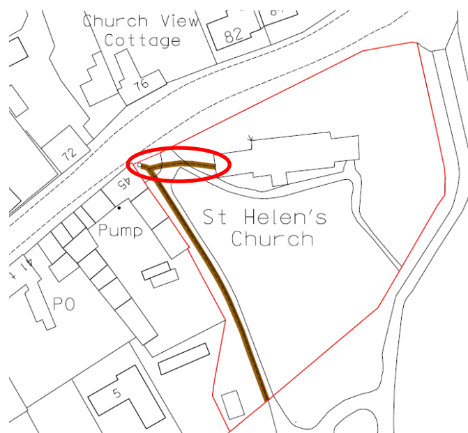
Figure 3. Proposed site plan provided by client.

The work adhered to their Standard and Guidance for Archaeological Watching Briefs (rev. 2008).