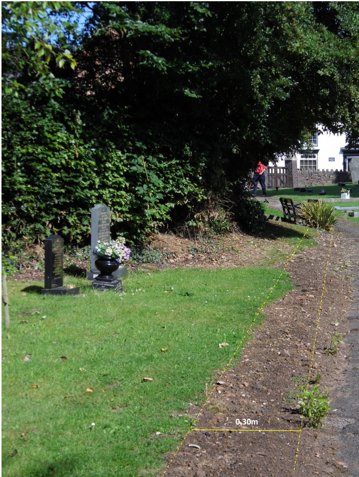
Figure 6. Churchyard with location of trench, facing north