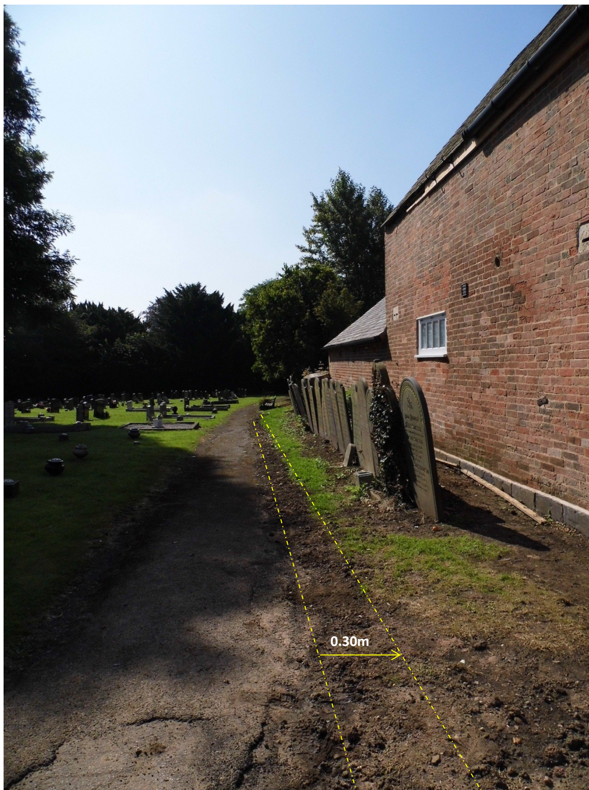
Figure 4. Churchyard, Facing south, indicating the location of the trench