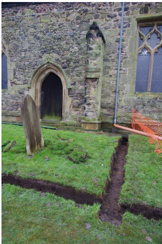
Figure 4 North trench and cross-trench, west side. Looking south