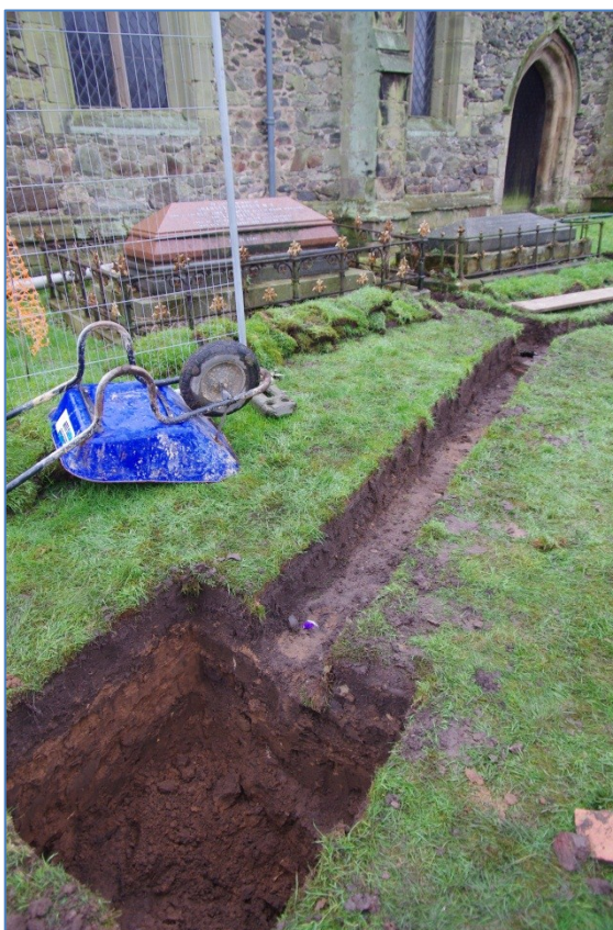
Figure 5 North trench, cross-trench, and soakaway under construction, east side. Looking south-west