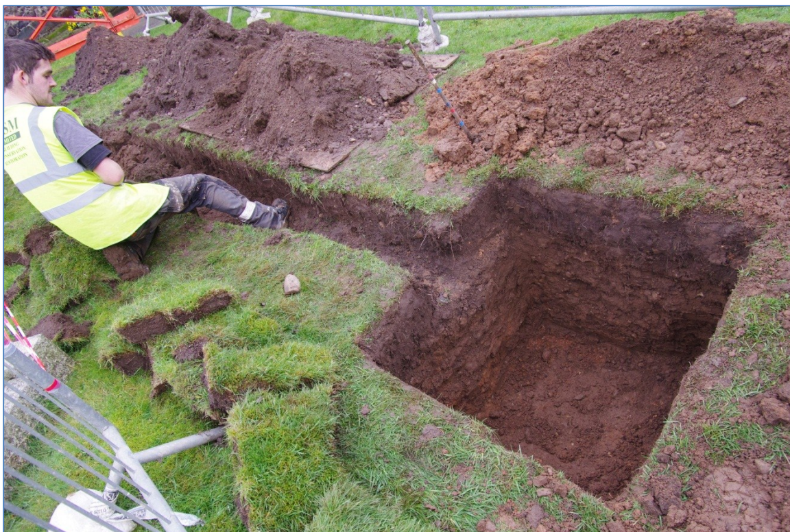
Figure 6 South soakaway and trench under construction, looking north-east