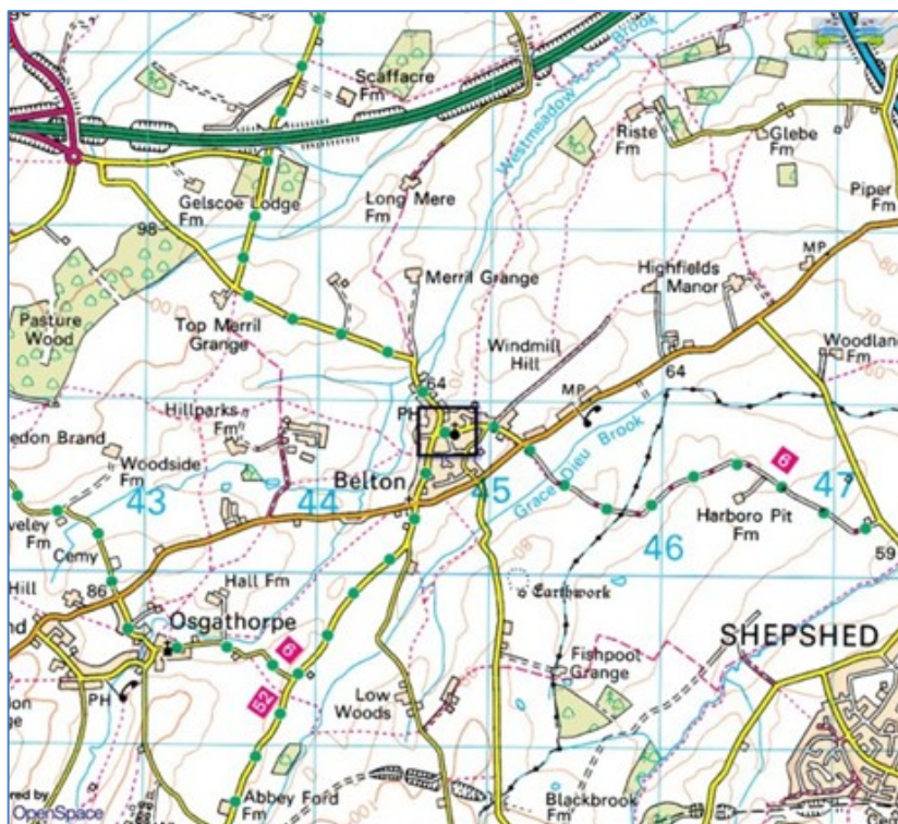
Figure 1 Belton, Leicestershire.

Contains Ordnance Survey data © Crown copyright and database right 2013