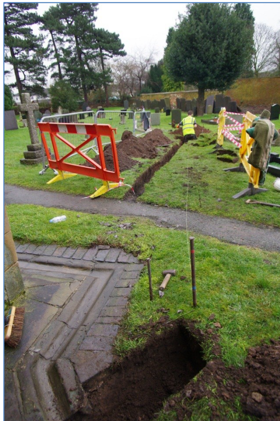
Figure 3 The south trench and soakaway (to the rear), looking south-east

As would be expected, there was an amount of charnel in the subsoil, and one potentially articulated skeleton was partially truncated during the work, but apart from this, no features or finds of archaeological significance were noted during the course of the works. All human bone disturbed was gathered up for re-interment in the churchyard.