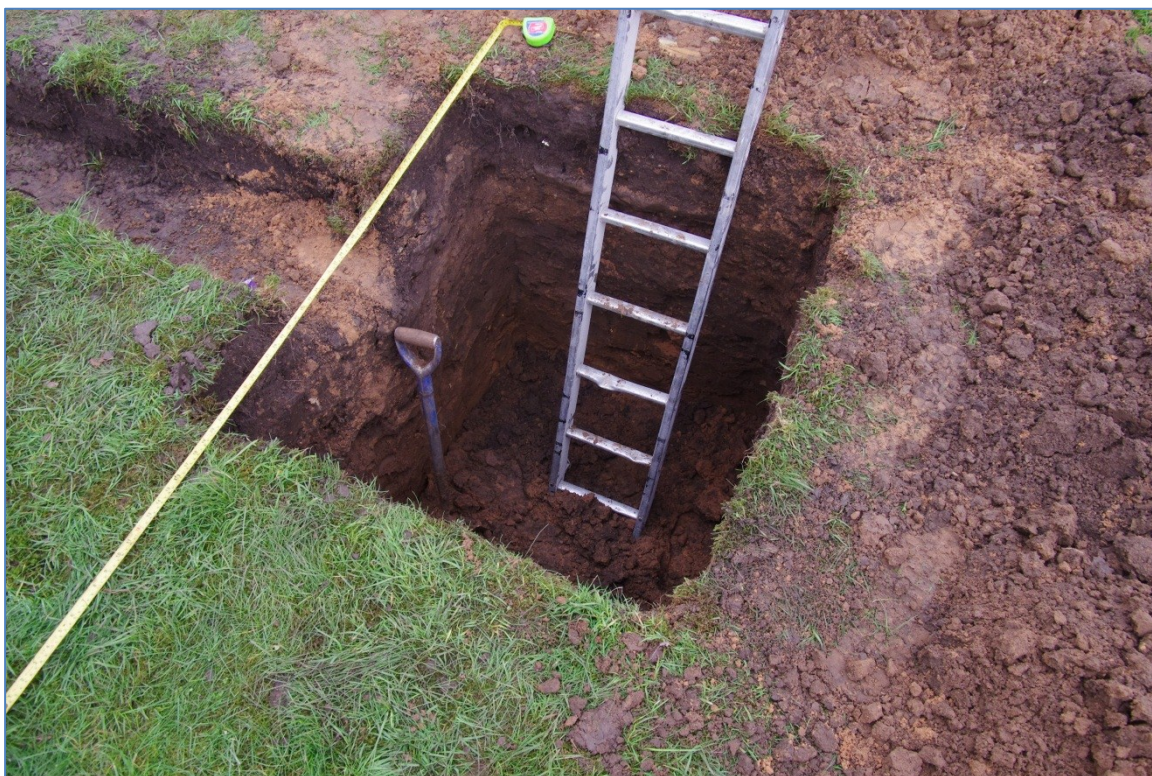
Figure 7 Northern soakaway, looking north-west