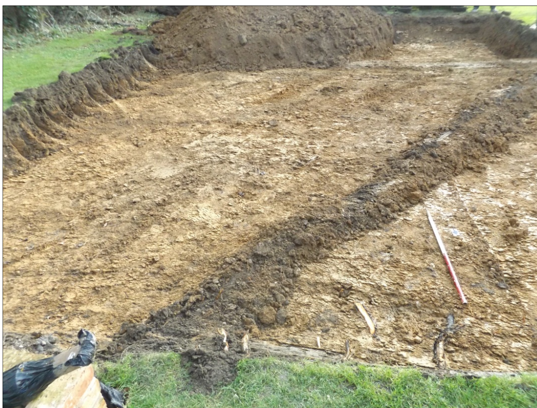
Figure 5 Stripped area facing south