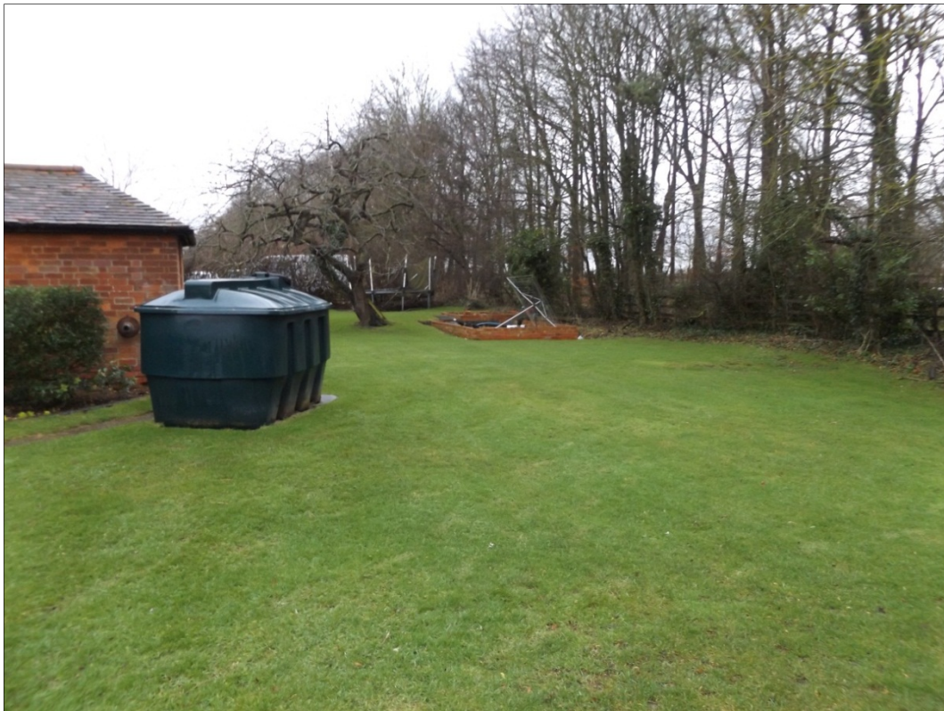
Figure 3 Area to be stripped. Facing north

No archaeological deposits, features or finds were observed or disturbed by the excavation.