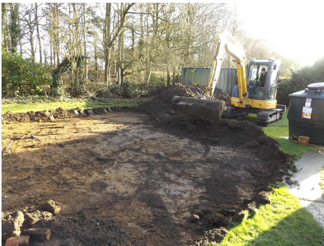
Figure 4 Area being stripped. Facing south-east