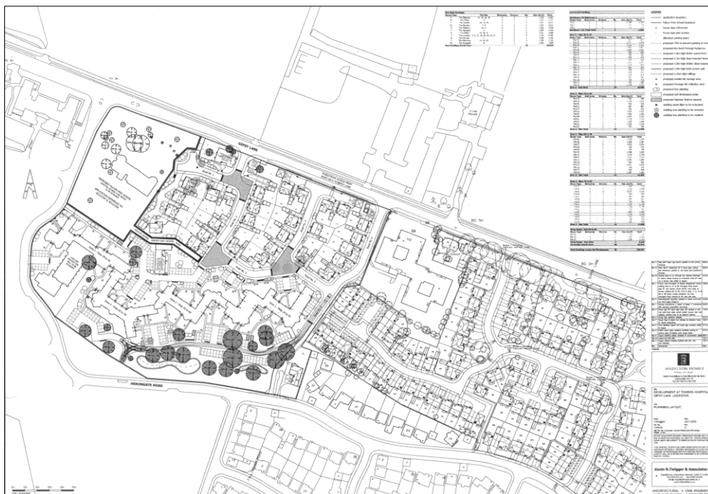
Figure 2: Proposed development (provided by client)