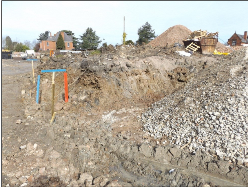
Figure 5: General view of site looking north-east. 13th April 2015