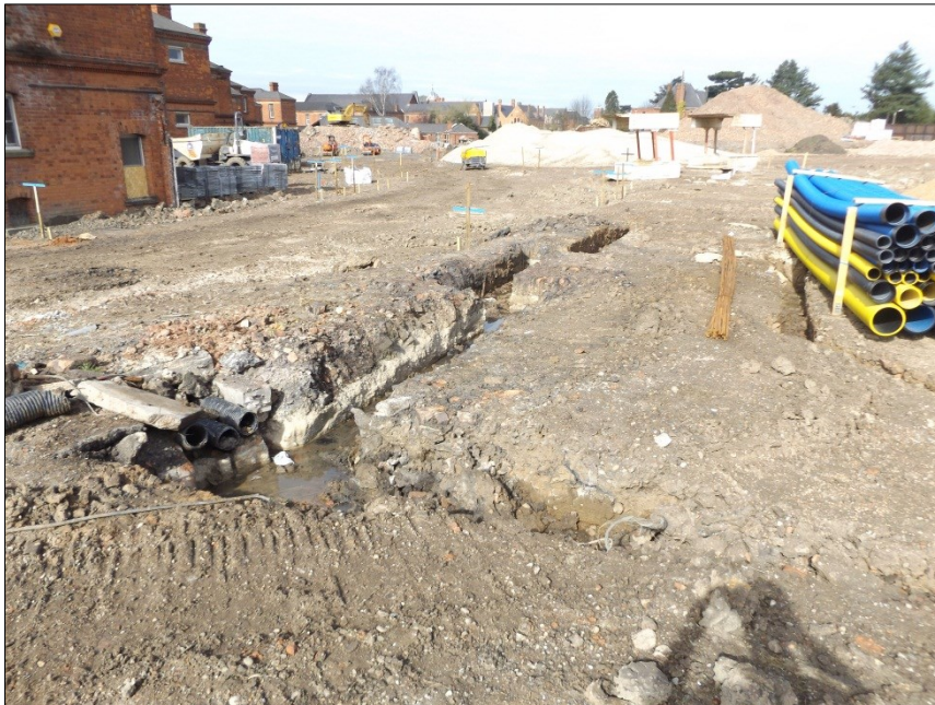
Figure 4: General view of site looking north. 13th April 2015