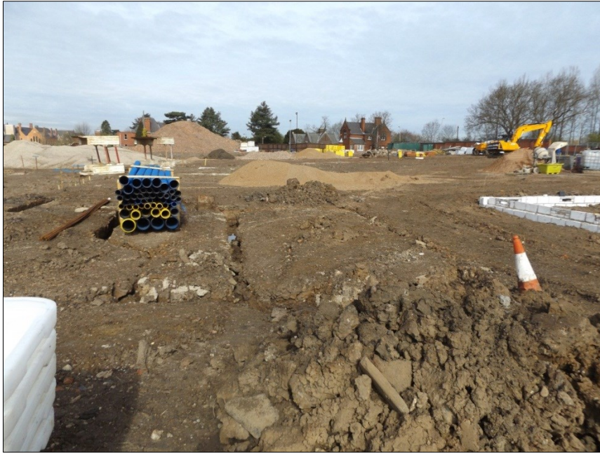
Figure 3: General view of site looking east. 13th April 2015