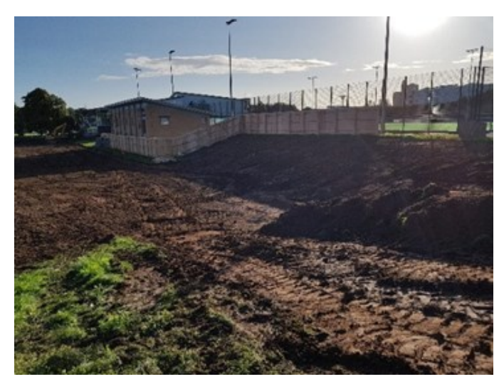
Figure 14: Looking north-east along the south-eastern boundary