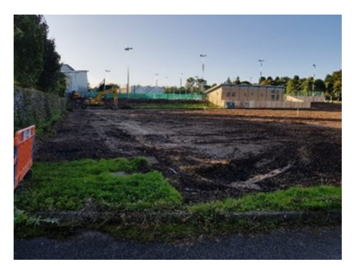
Figure 5: Looking south-east from the north-western extent of the site