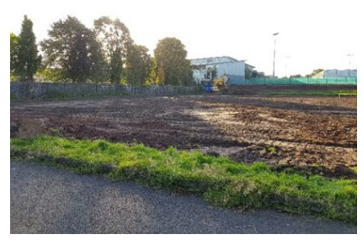
Figure 4: Looking north-east from the westernmost point of the site