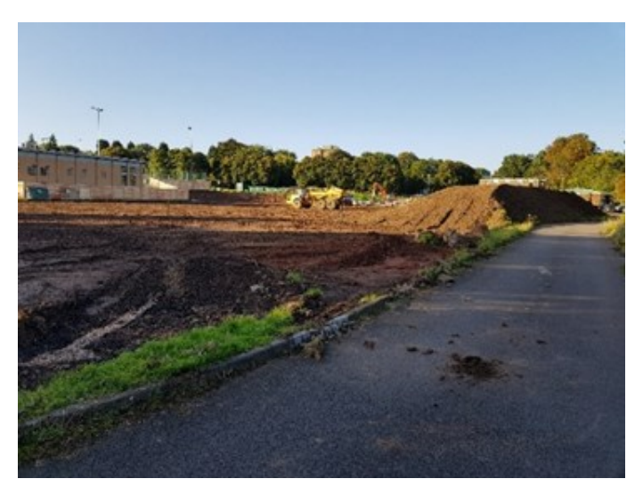
Figure 6: Looking south-west along the north-western boundary