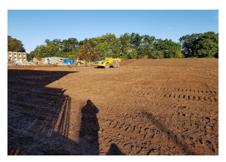
Figure 9: Looking north-west from the southernmost point of the site