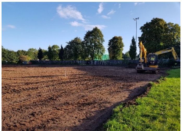
Figure 7: Looking north-east along the south-eastern boundary