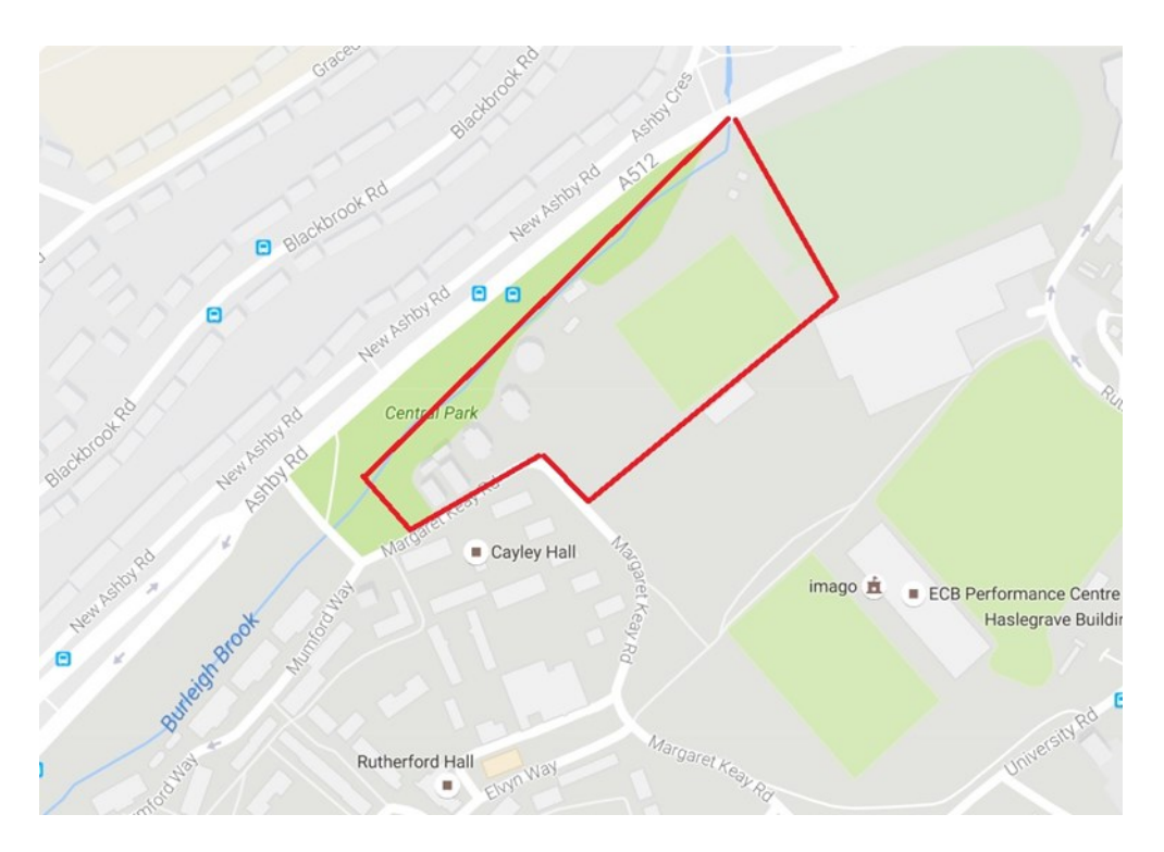
Figure 2: Location of site.