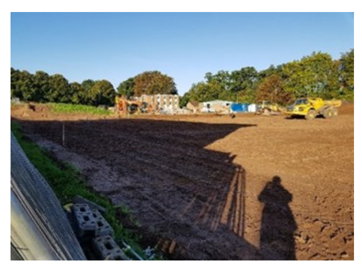
Figure 10: Looking north-west from the southernmost point of the site