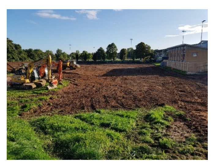
Figure 13: Looking north-east along the south eastern boundary