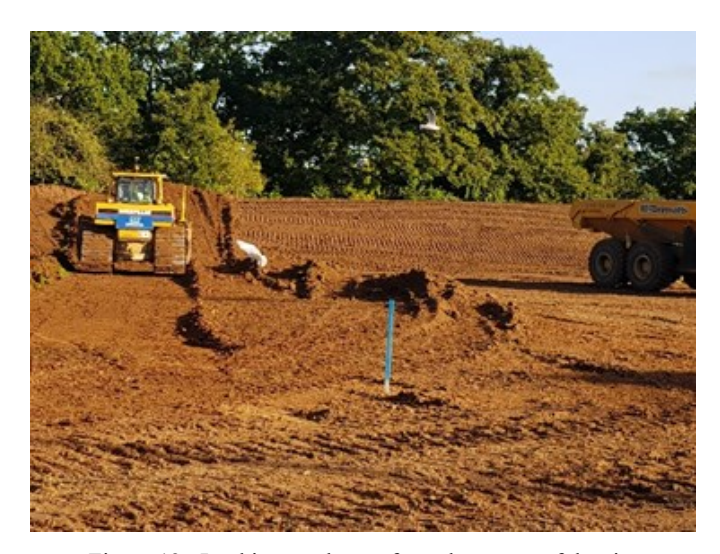
Figure 12: Looking north-east from the centre of the site