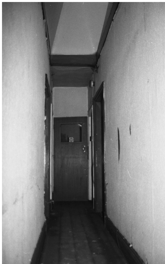
Plate 30 Second floor corridor with o/head lightsink looking to LHS