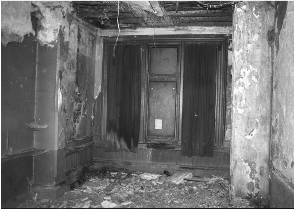
Plate 20 Ground floor RHS room looking to front