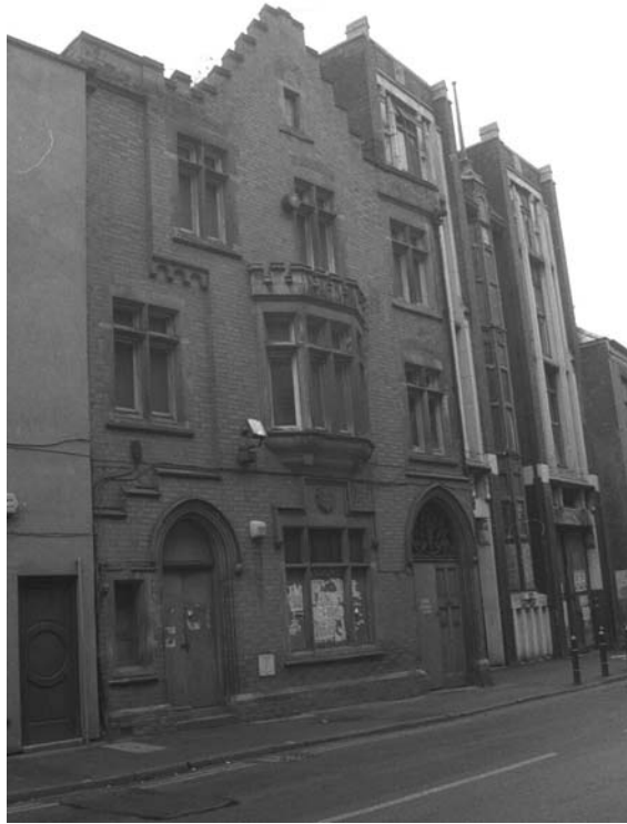
Plate 25 Frontage