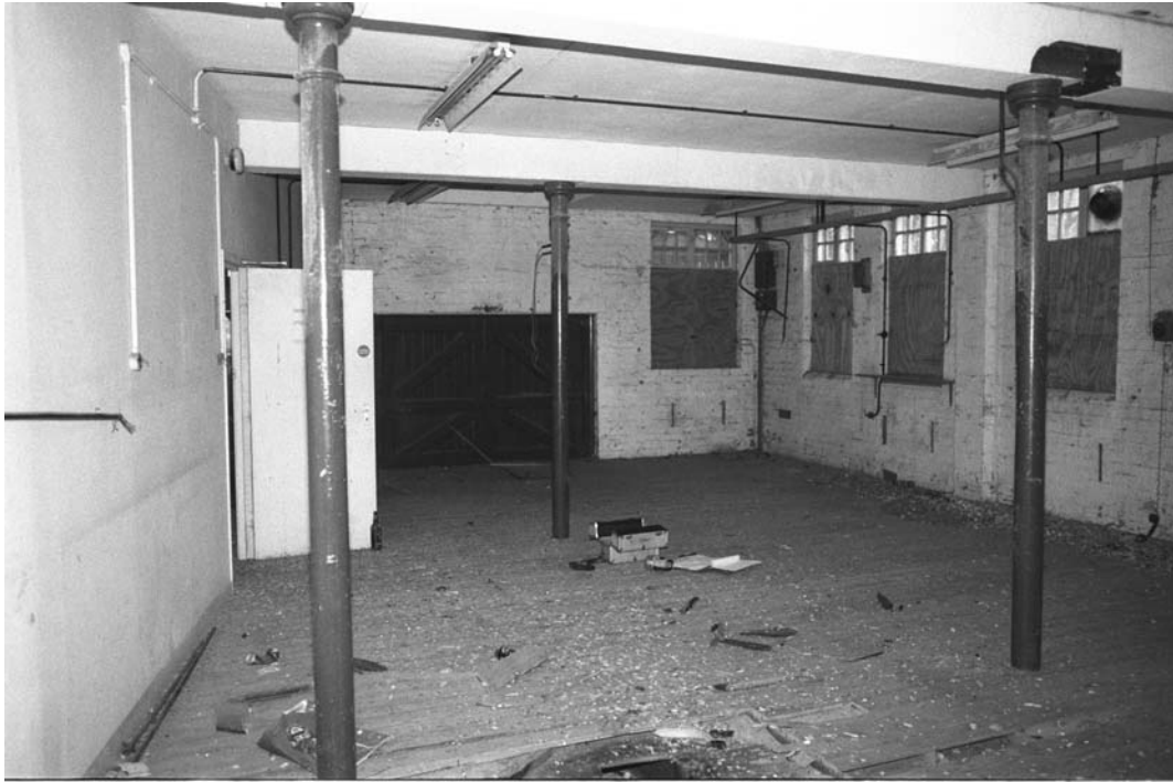
Plate 37 Upper ground floor looking to front