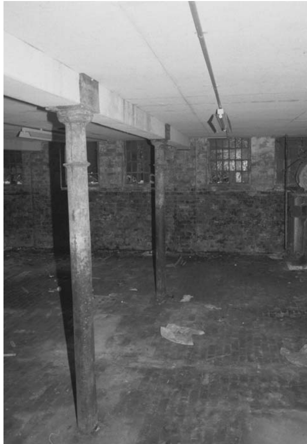
Plate 39: Lower ground floor looking to LHS