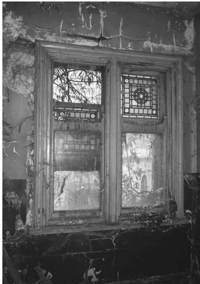
Plate 21 First floor central window