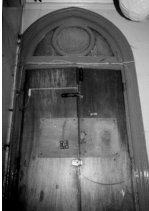
Plate 33 Main entrance looking towards street