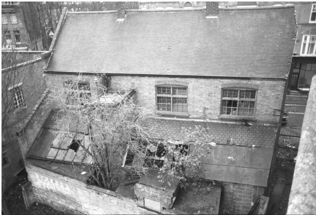
Plate 2 Rear