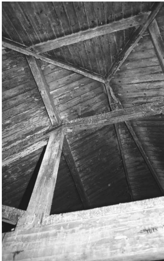
Plate 44 Detail of roof structure (note V twin ridge piece)