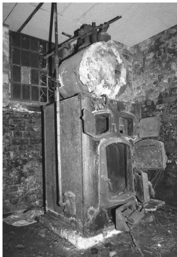
Plate 40 Lower ground floor boiler