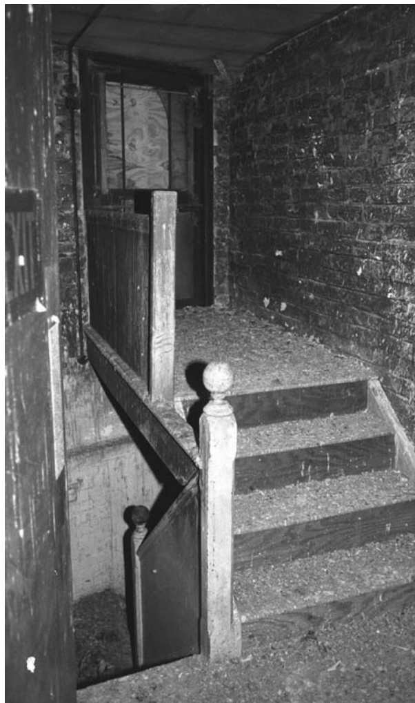
Plate 42 Top floor stairway looking to rear