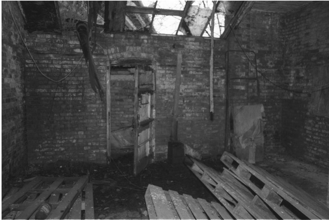
Plate 5 LHS ground floor bay looking to rear