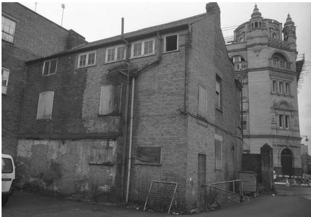
Plate 16 Side and Rear