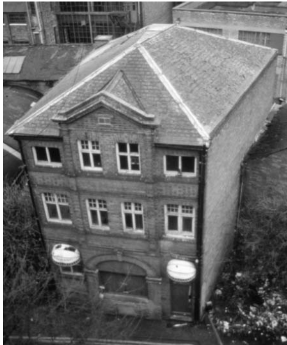
Plate 36 Birds eye view