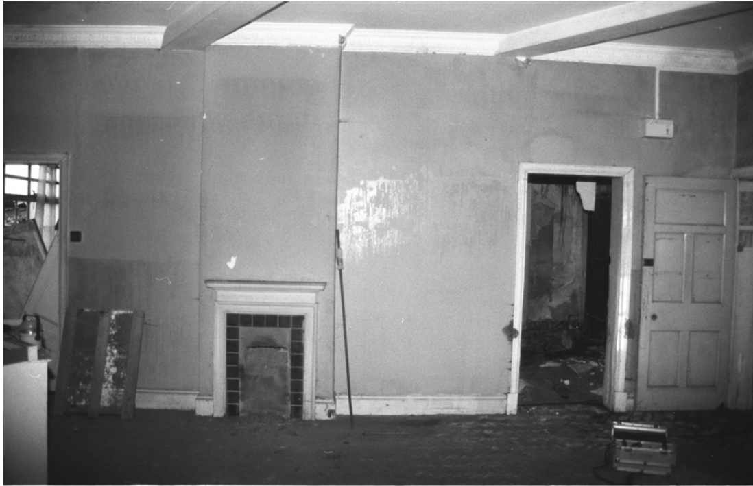
Plate 11 Main room looking to rear