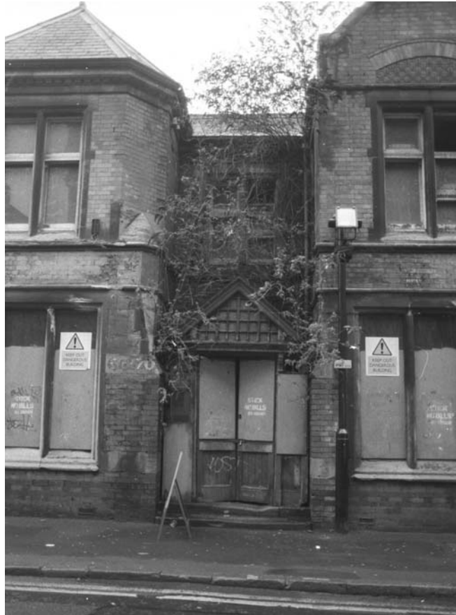
Plate 15 Frontage