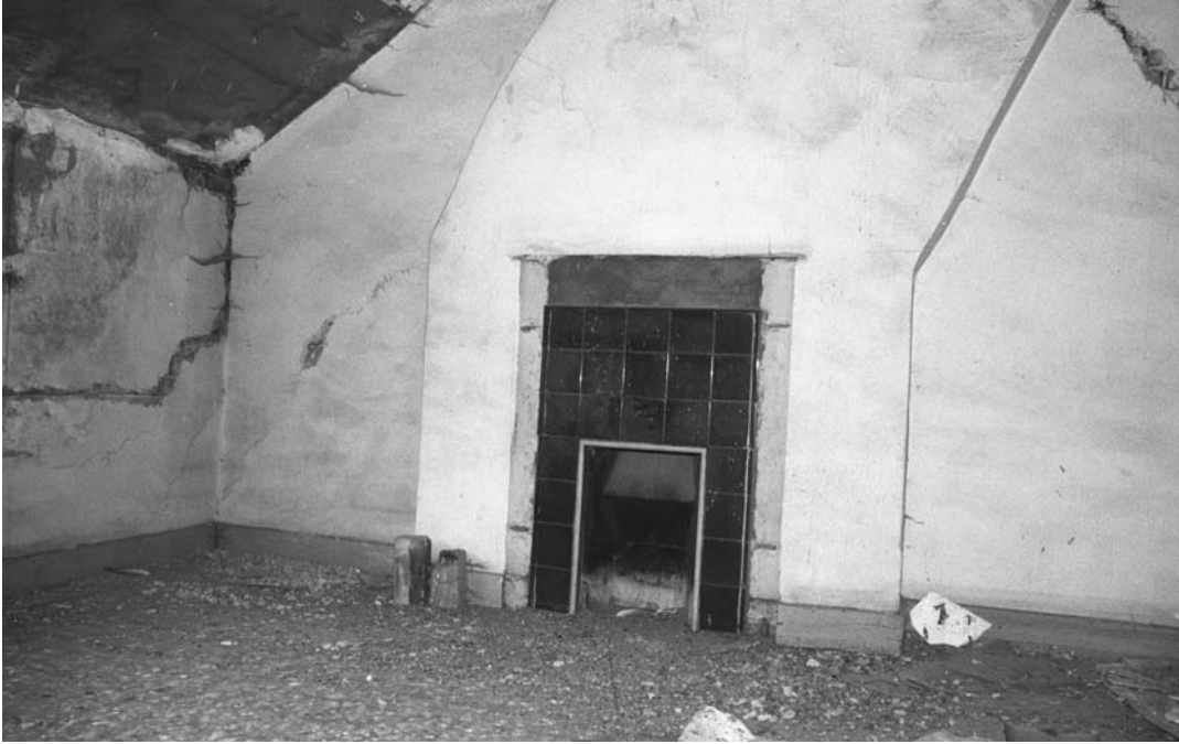
Plate 24 Top floor RHS room looking to side