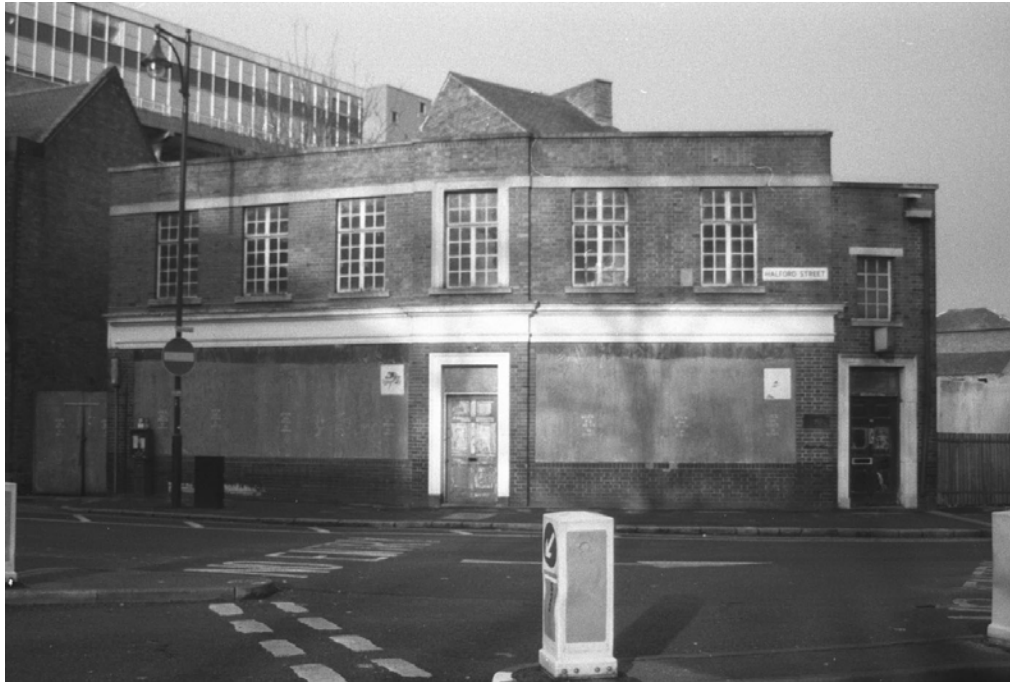
Plate 9 Frontage