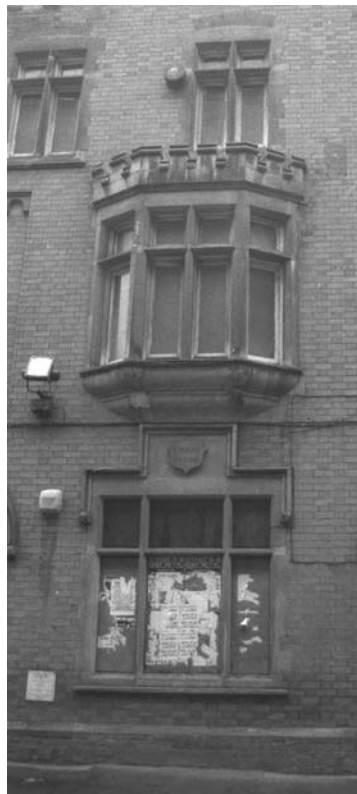
Plate 26 Detail of frontage