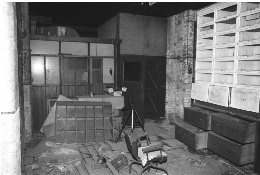
Plate 6 RHS ground floor bay looking to front