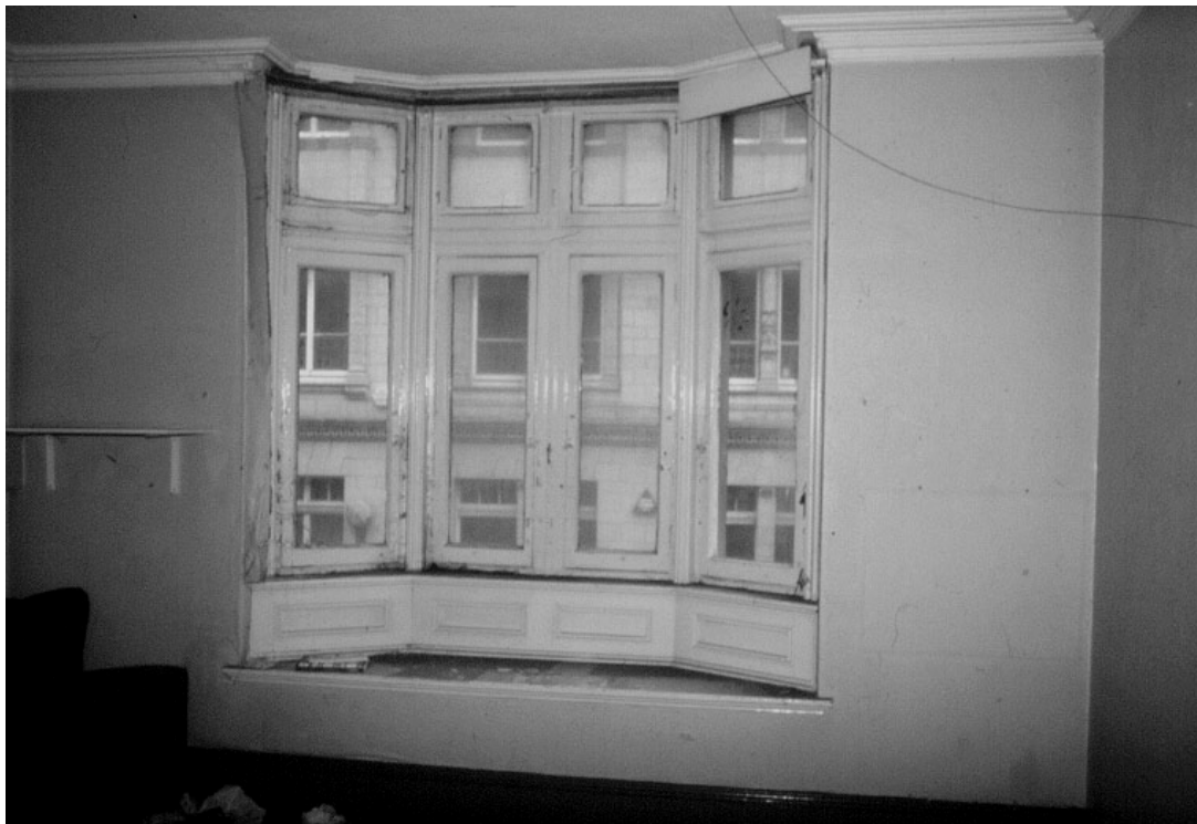
Plate 32 First floor main room looking into front bay