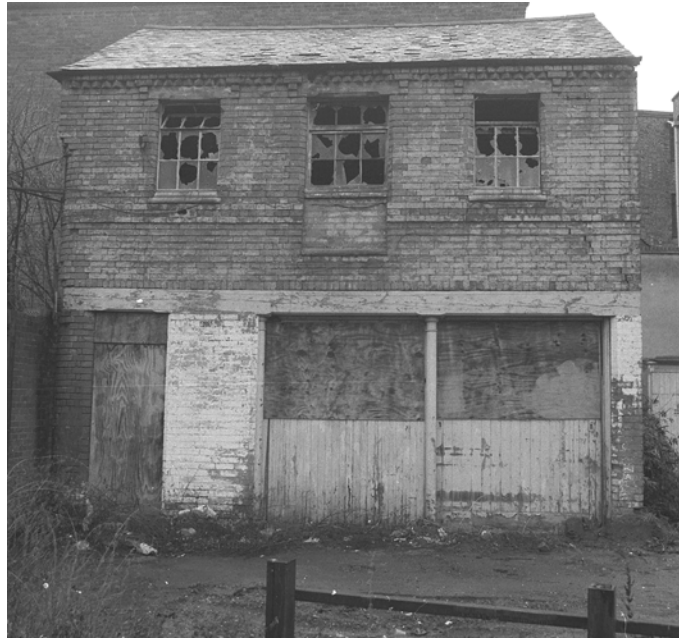
Plate 45 Carhouse to the side of 10 Vestry St