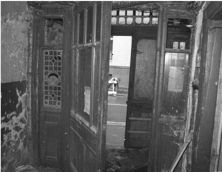
Plate 18 Entrance hall looking out to street