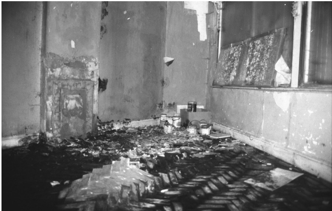
Plate 12 RHS room looking to rear/side