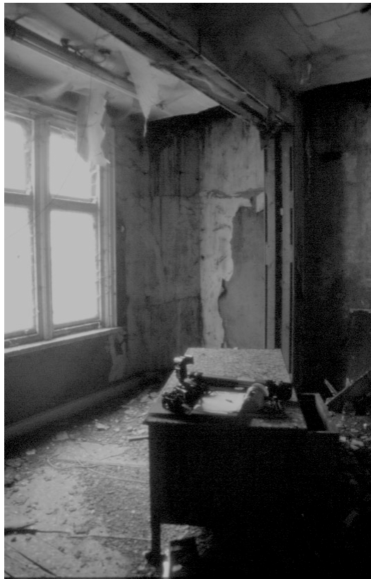
Plate 23 First floor LHS room looking to side/front