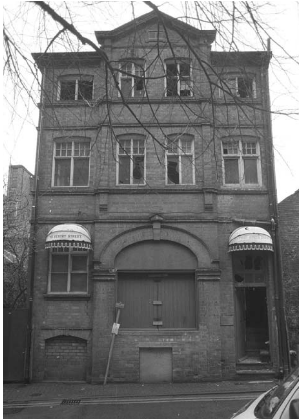
Plate 35 Frontage