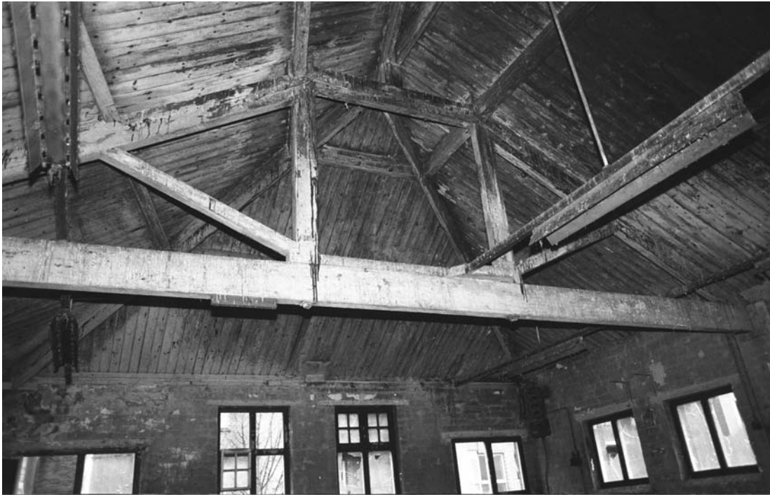
Plate 43 Roof structure looking to front