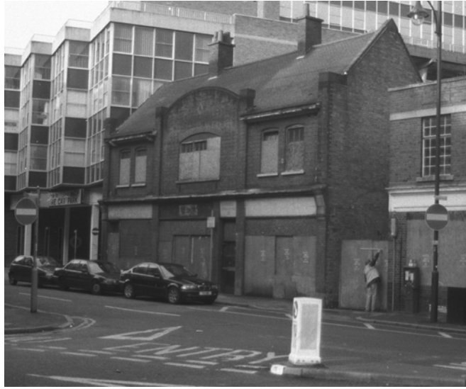
Plate 1 Frontage