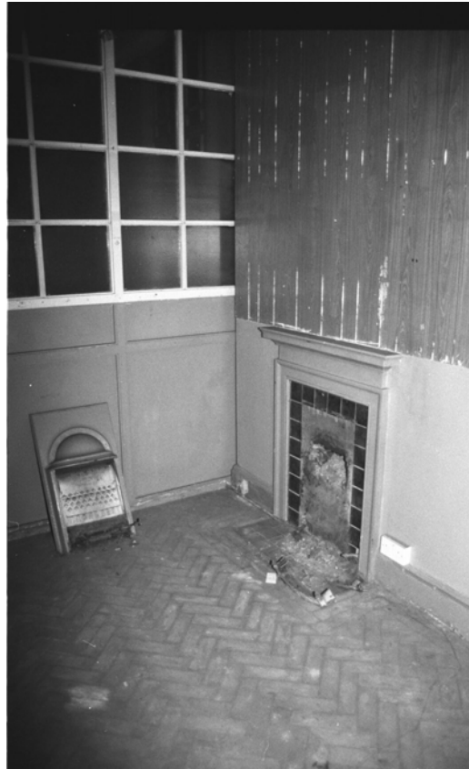
Plate 13 Partition room looking to front