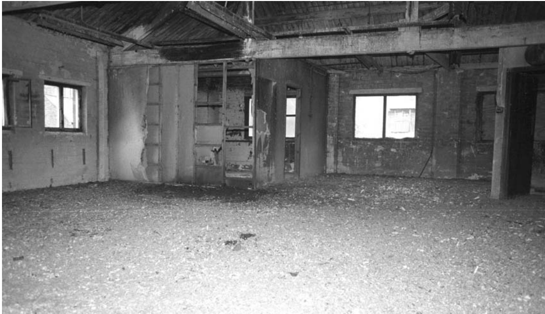
Plate 41 Top floor looking to the rear