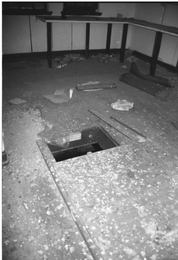
Plate 8 LHS first floor bay looking to front