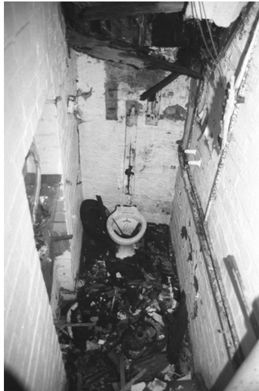
Plate 14 Basement toilet