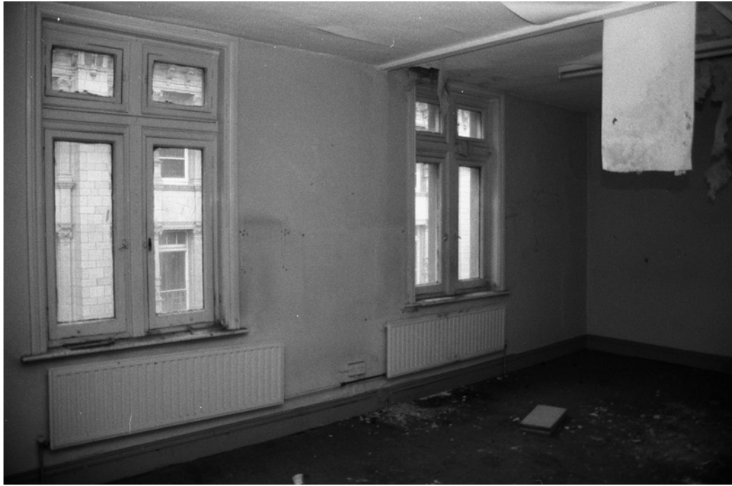
Plate 29 Second floor main room looking to front/side