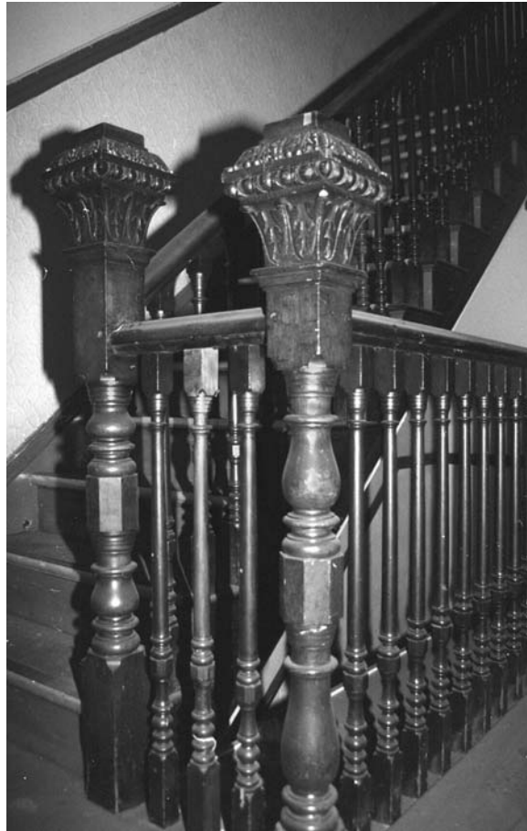
Plate 31 Decorated finials