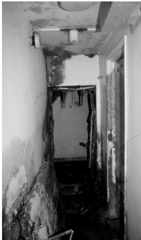
Plate 34 Basement corridor