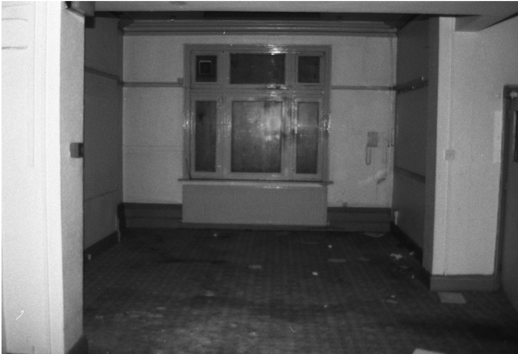
Plate 28 Ground floor main room looking to front