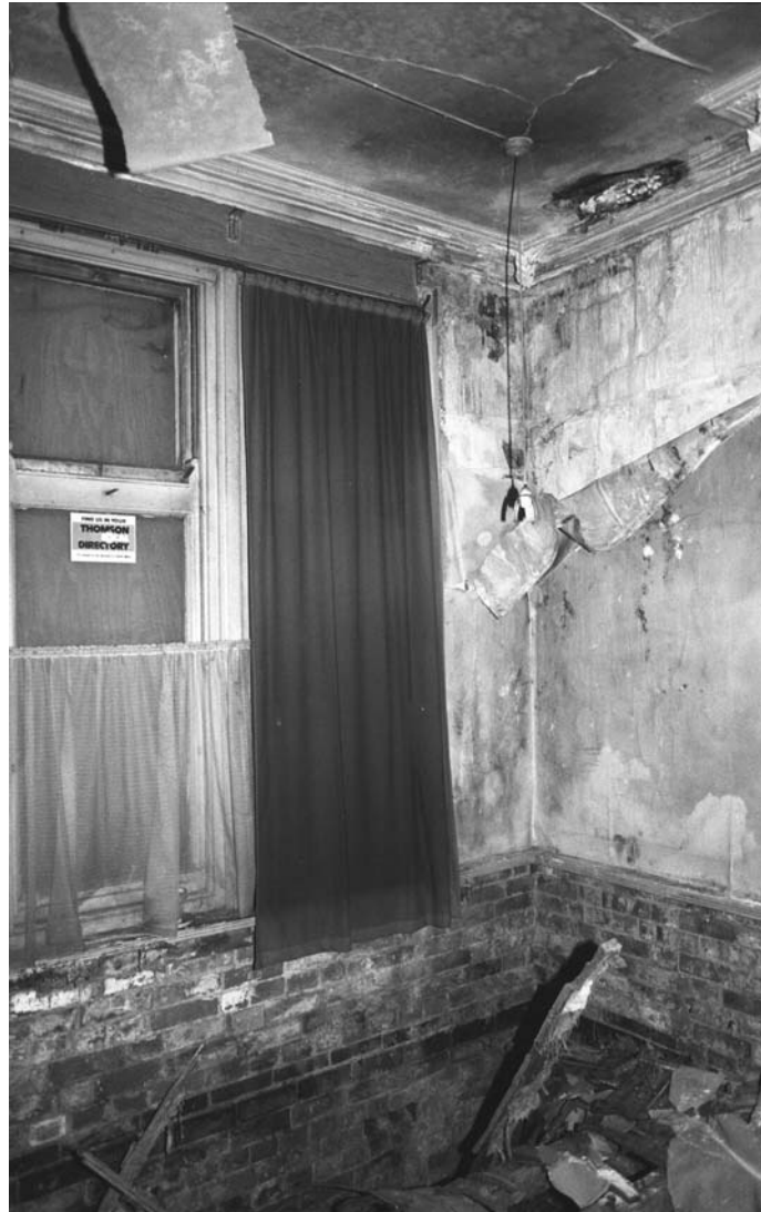
Plate 19 Ground floor LHS room looking to street/side