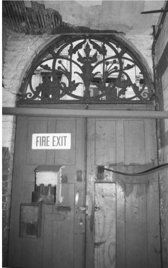
Plate 27 Decorative fanlight over double doors to street