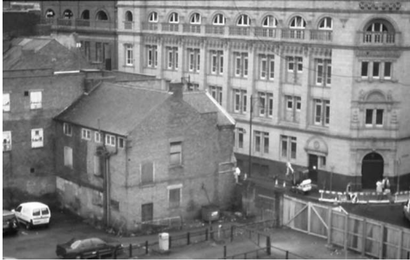
Plate 17 Side and Rear