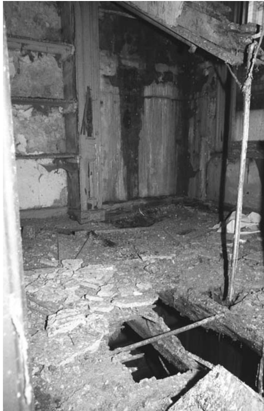
Plate 22 First floor RHS room looking to side/front