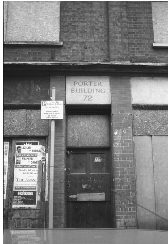
Plate 3 Detail of Frontage