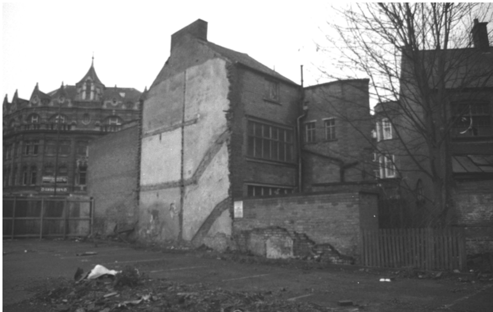
Plate 10 Side and Rear