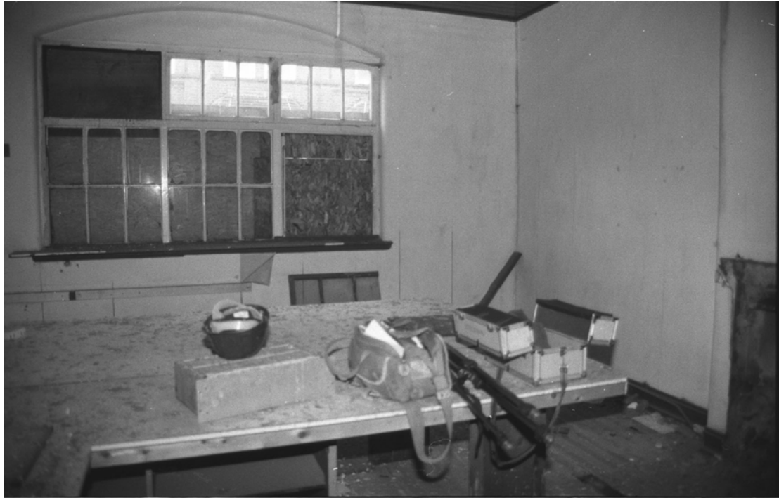
Plate 7 Central first floor bay looking to front