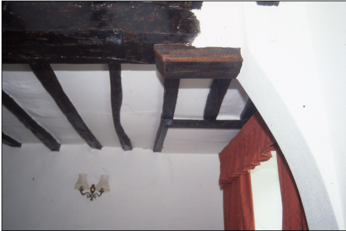
Fig 12 East bay, ground floor, looking north