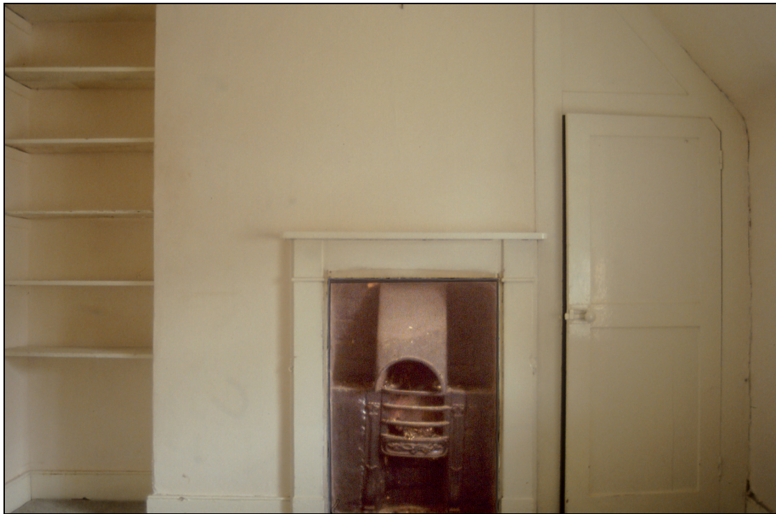
Fig 13 First floor central bay, looking east