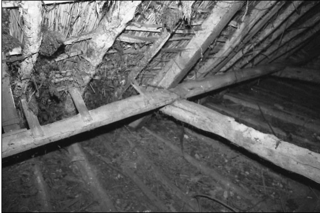
Fig 18 Roof space from central bay looking southwest