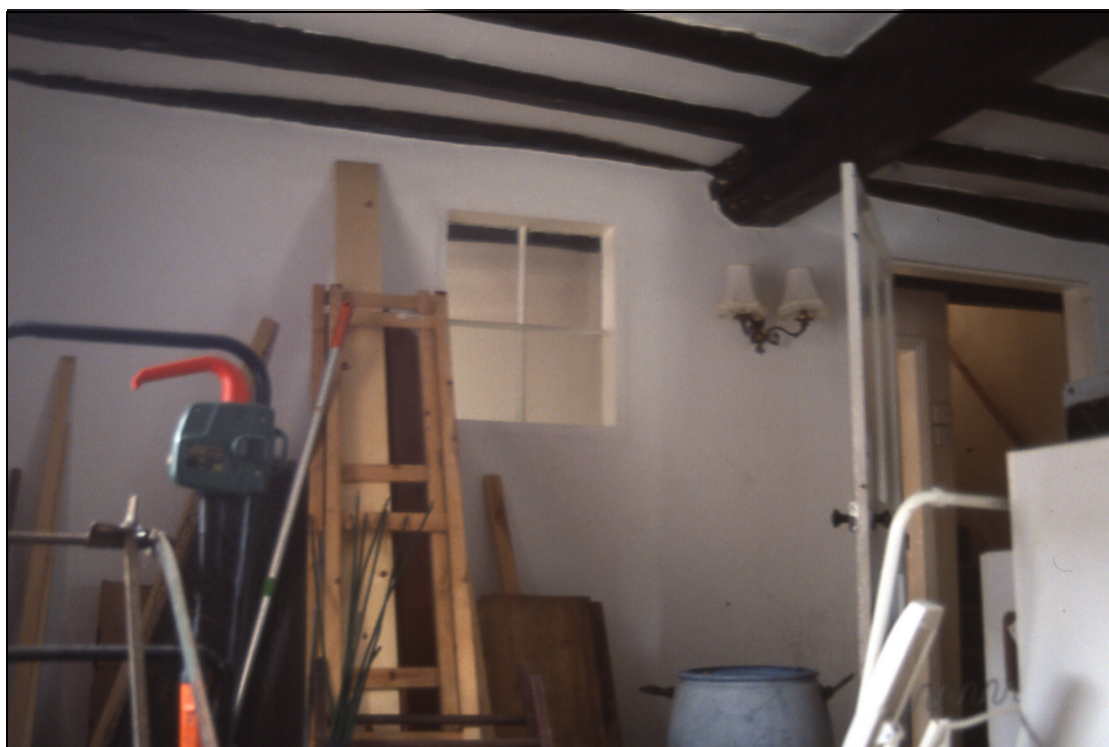
Fig 10 East bay, ground floor, looking westnorthwest