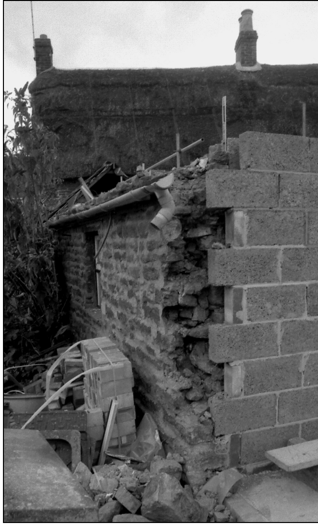
Fig 7 East wall of outbuildings, looking southwest