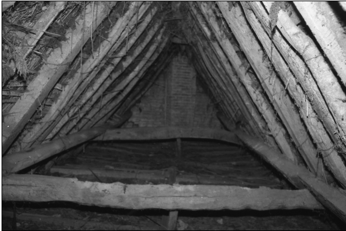
Fig 16 Roof space from central bay looking west