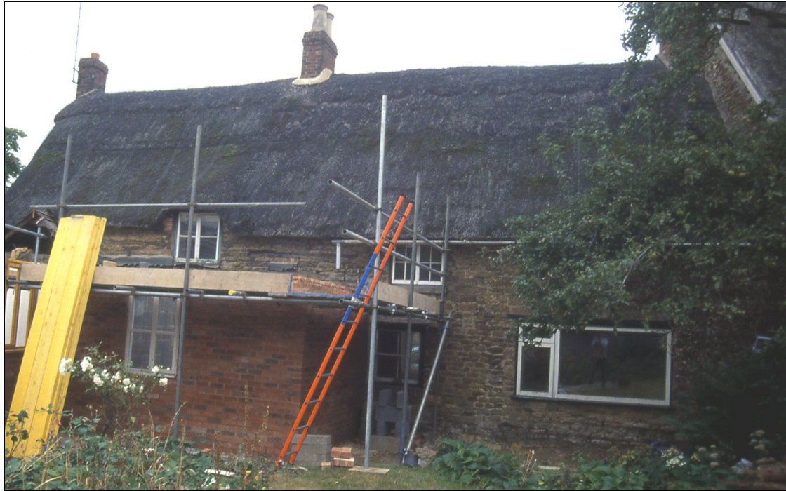
Fig 6 Rear, looking south