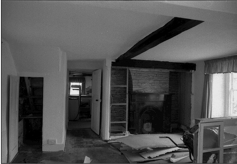
Fig 8 West and central bays, ground floor, looking east