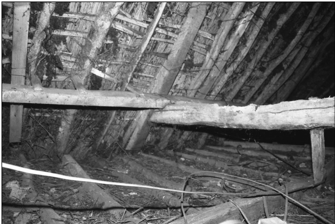
Fig 17 Roof space from central bay looking west-southwest