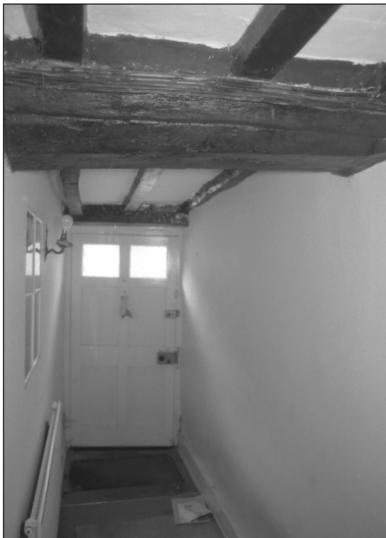
Fig 11 Passage, ground floor, looking south