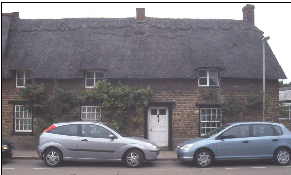
Fig 3 Frontage, looking north