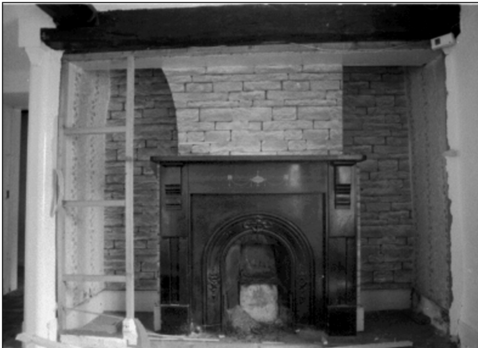
Fig 9 Central bay fireplace, ground floor, looking east