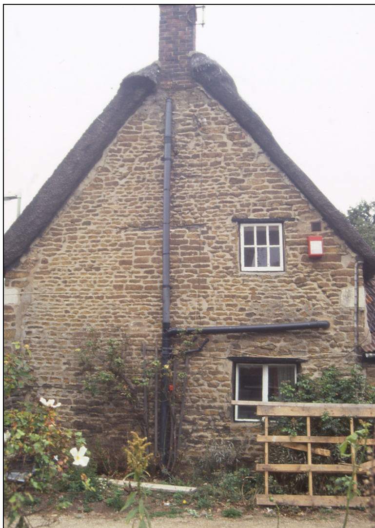
Fig 5 Gable, looking west