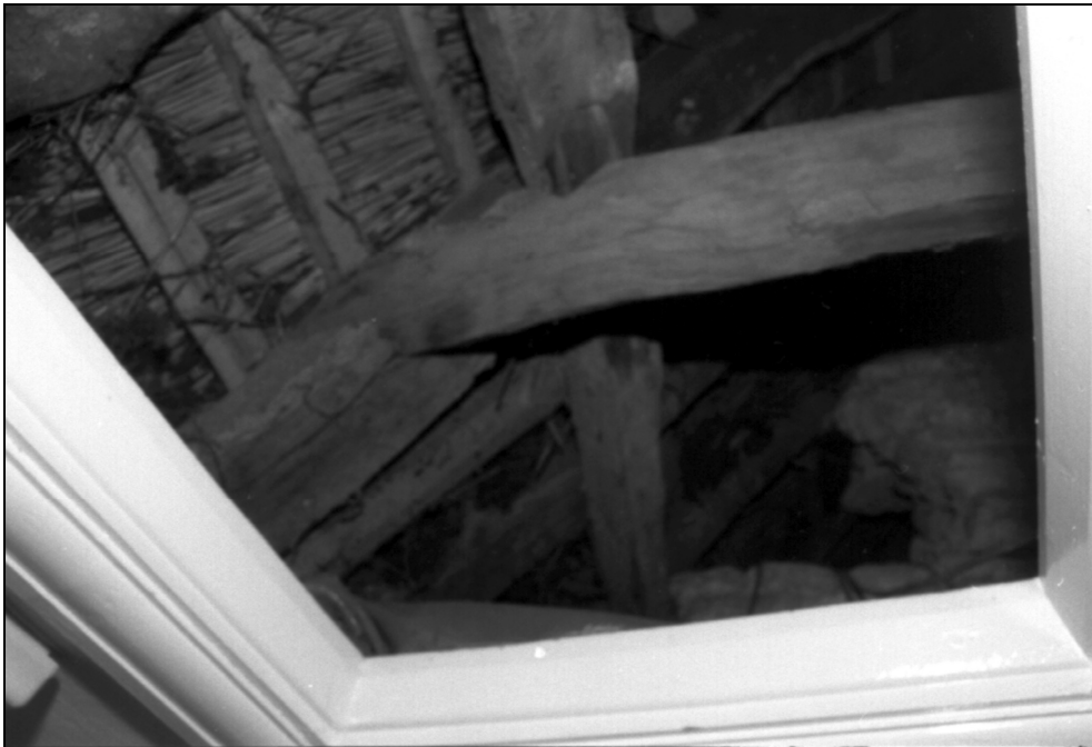
Fig 15 View into roof space from first floor landing