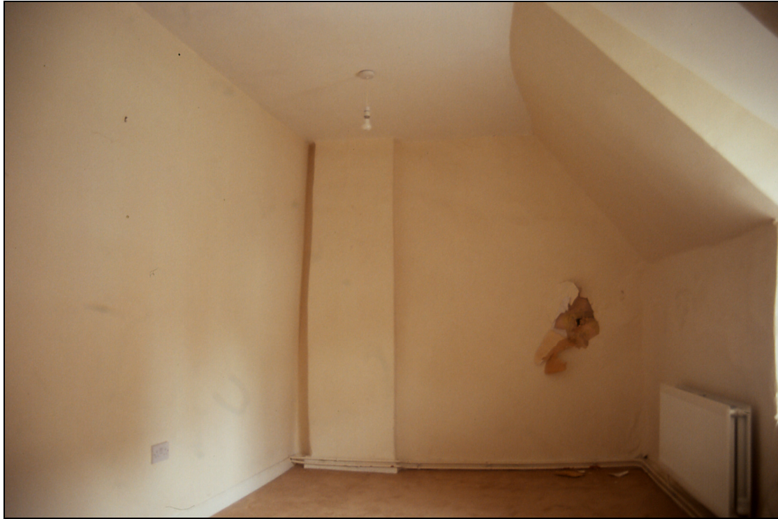
Fig 14 First floor east bay, looking east