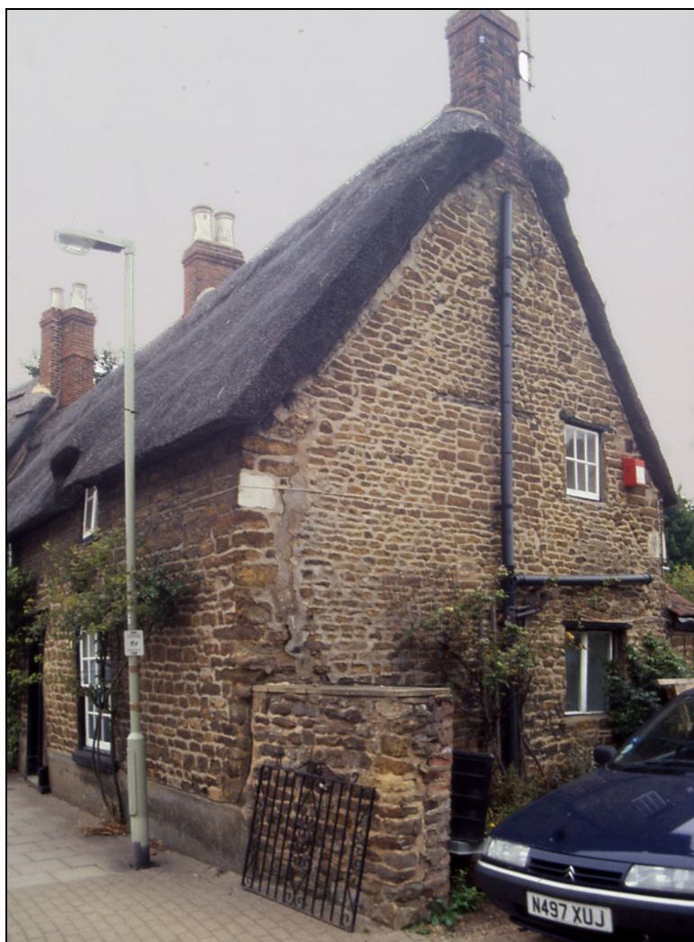
Fig 4 Front and gable, looking northwest