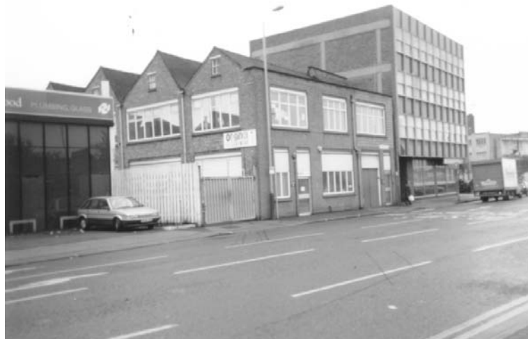
Figure 2: St Peter's Lane Elevation (north facing) of the Norman Underwood Building (Ripper, 2003)