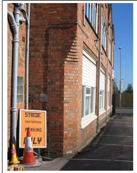
Figure 4: Close up of raking brickwork