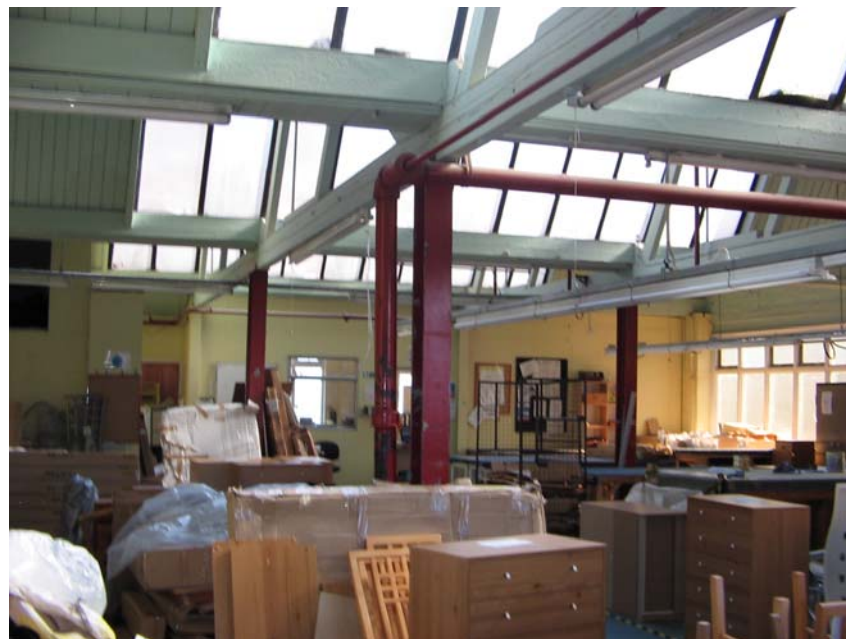
Figure 5: Interior of the Norman Underwood building illustrating northern light windows