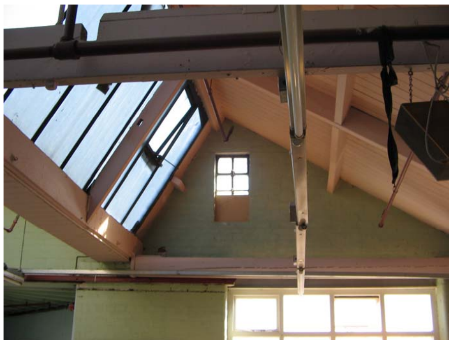
Figure 7: Details of roof structure in south building