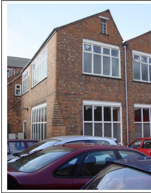
Figure 3: East facing elevation illustrating raking brickwork (Ripper, 2003)