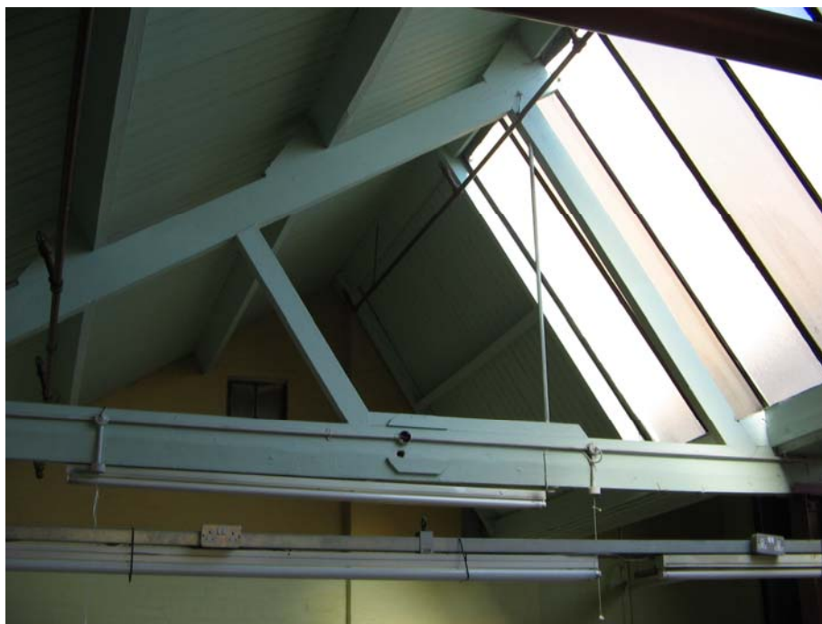
Figure 6: Details of roof structure in north building