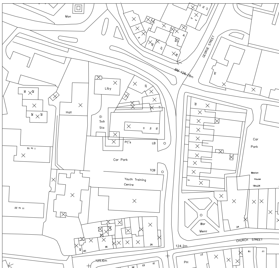
Figure 2: Development area (situated in the centre of the plan). Scale 1: 1000.