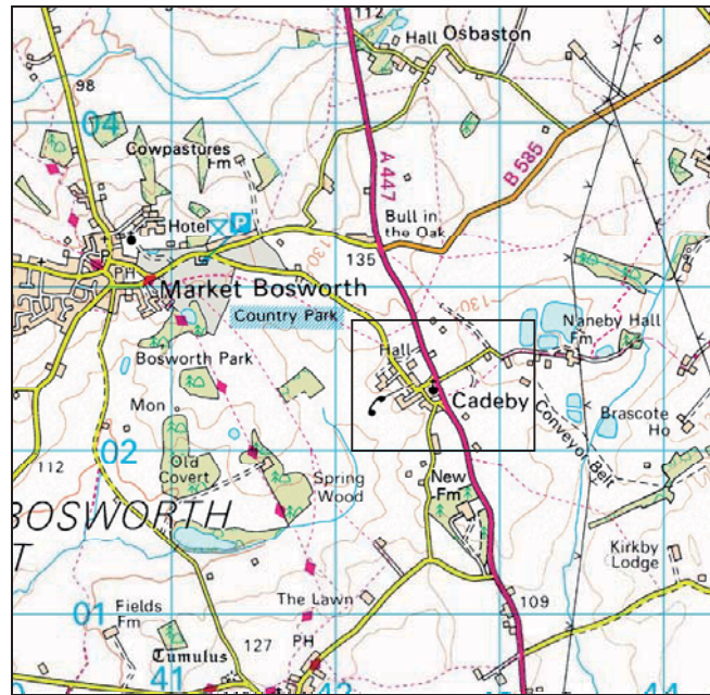
Figure 1: Site location. Reproduced from Landranger® 1:50 000 scale by permission of Ordnance Survey® on behalf of The Controller of Her Majesty's Stationery Office. © Crown copyright. All rights reserved. Licence number AL 100021187.