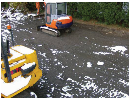
5. View of site during construction from south