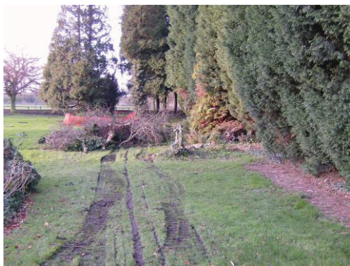
3. View of site prior to construction from east