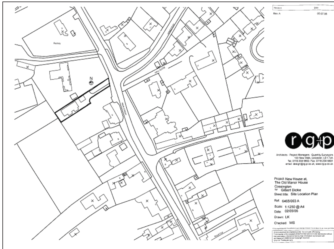
Figure 2: Location within Cossington of the proposed development. Plan supplied by developers.

All work was undertaken in accordance with the Institute of Field Archaeologists (IFA) Code of Conduct and adhering to their Standard and Guidance for an Archaeological Watching Brief .