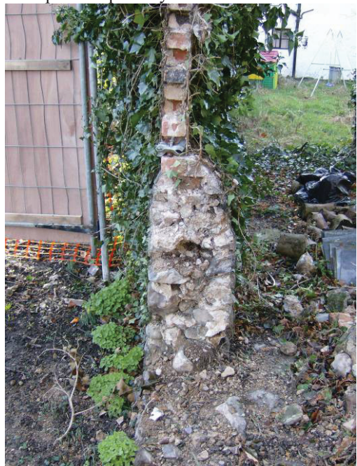
8. Section through wall for access