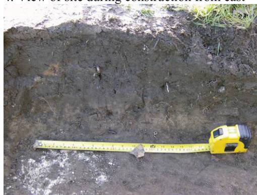
6. Depth of topsoil by Main Street