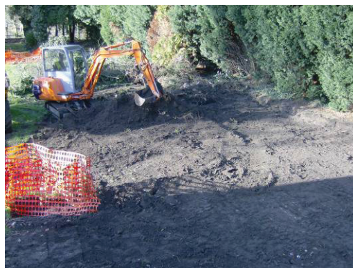
4. View of site during construction from east