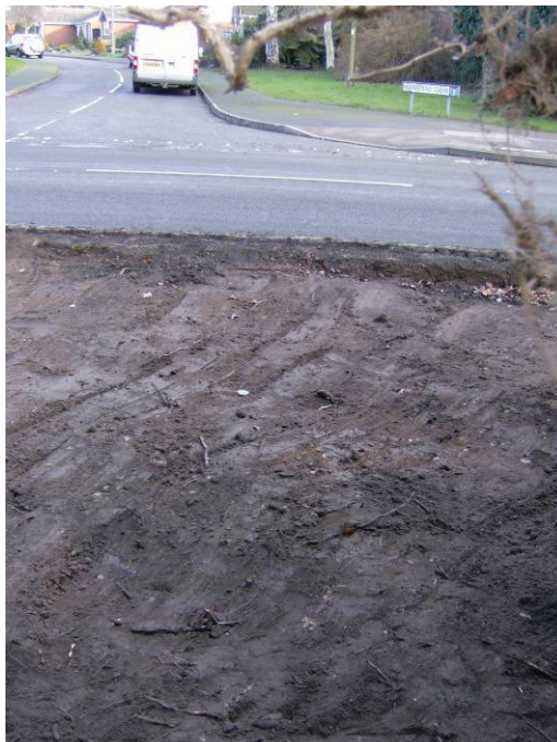
7. Stripped area by the entrance from Main Street from west