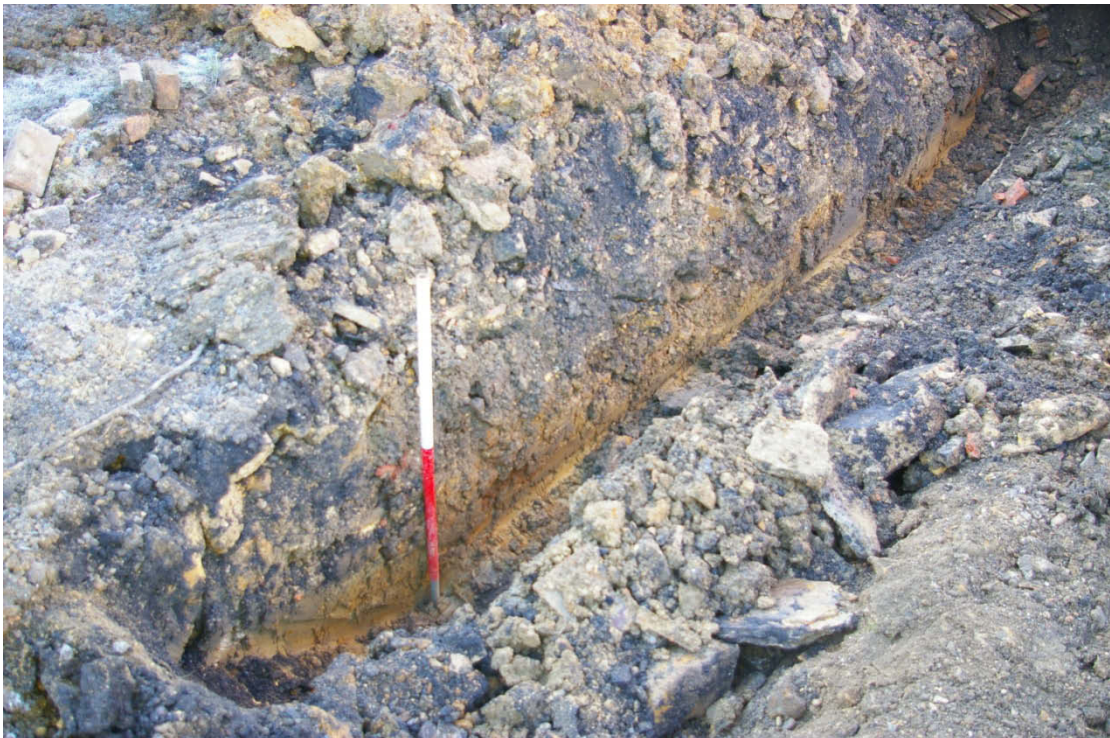
Figure 4: New development footing showing modern overburden / demolition overlying natural clay, scale 1m.