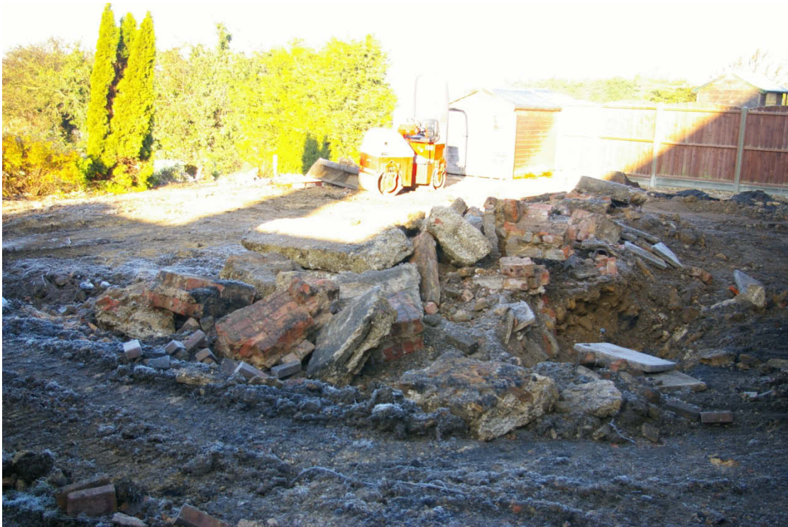
Figure 3: Demolished building, looking north