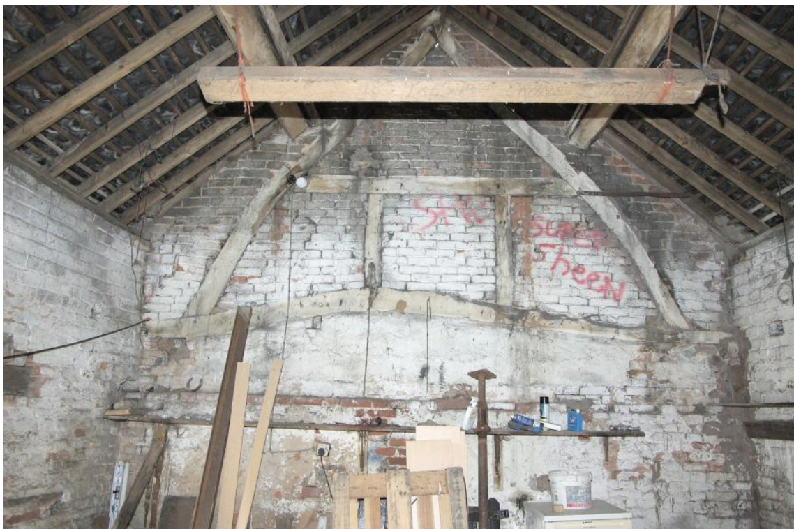
Figure 4 Southern (Left Hand) Roof Truss.