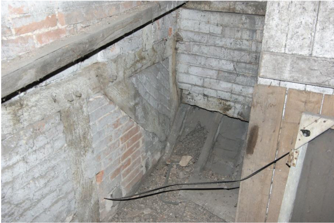
Figure 7 Limited View of Roof Trusses from Possible Earlier Building.