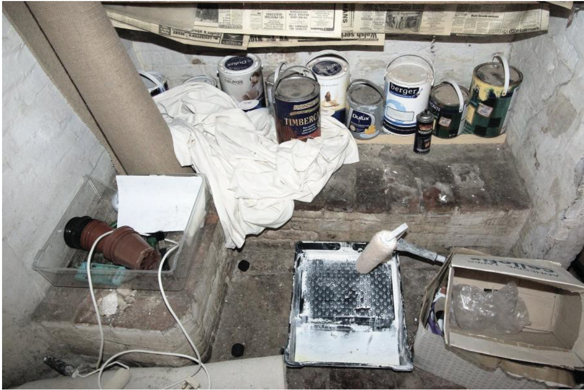
Figure 9 Thrall.