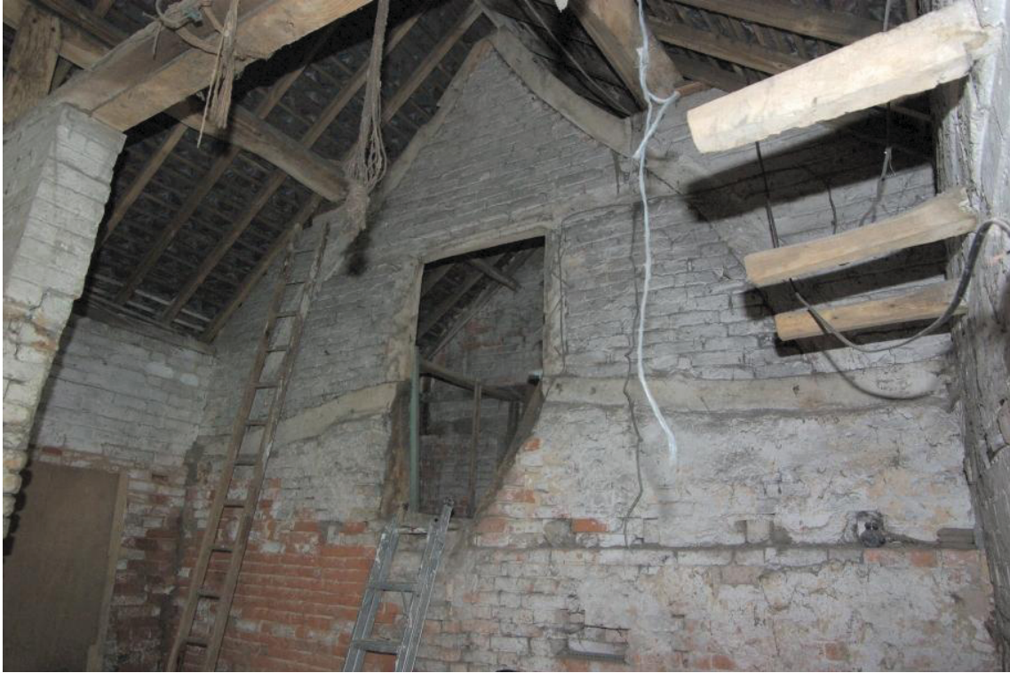
Figure 5 Northern (Right Hand) Roof Truss.