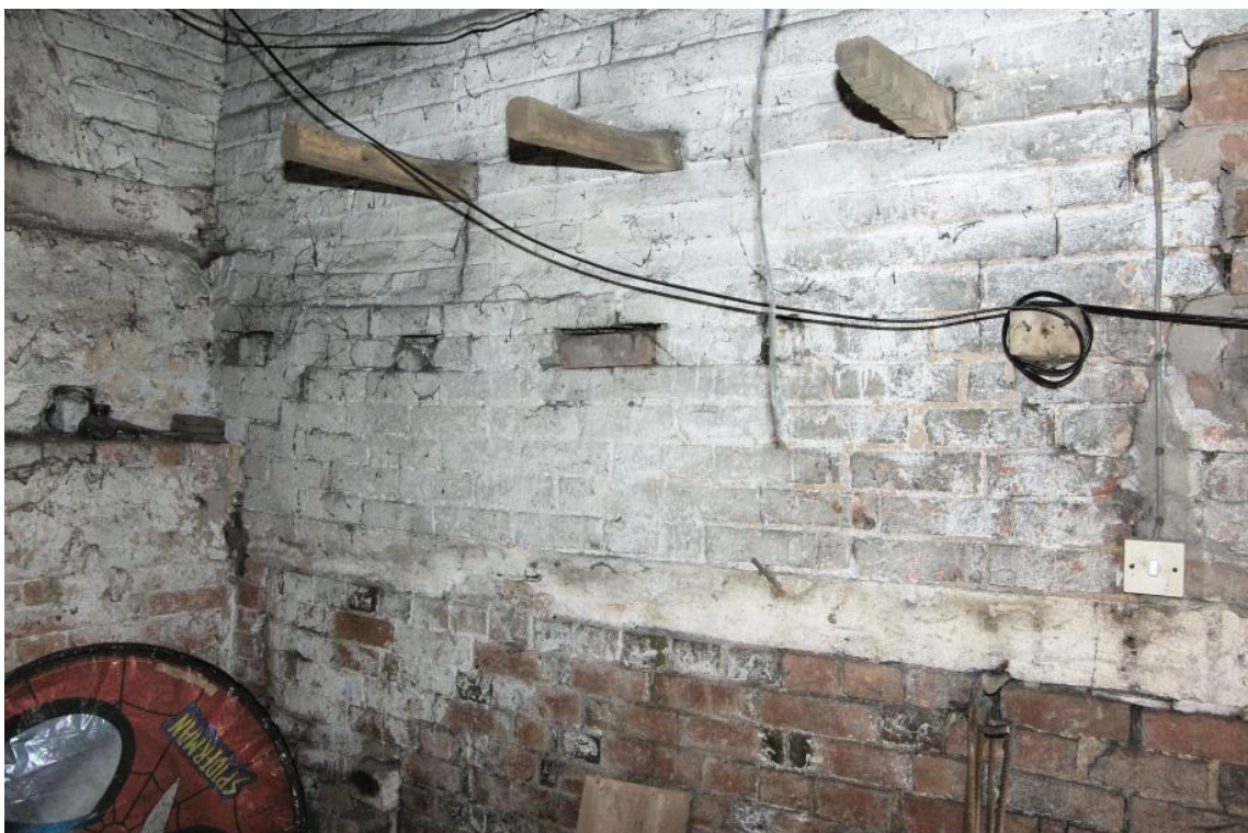
Figure 8 Possible Saddle Tree on Front Wall.