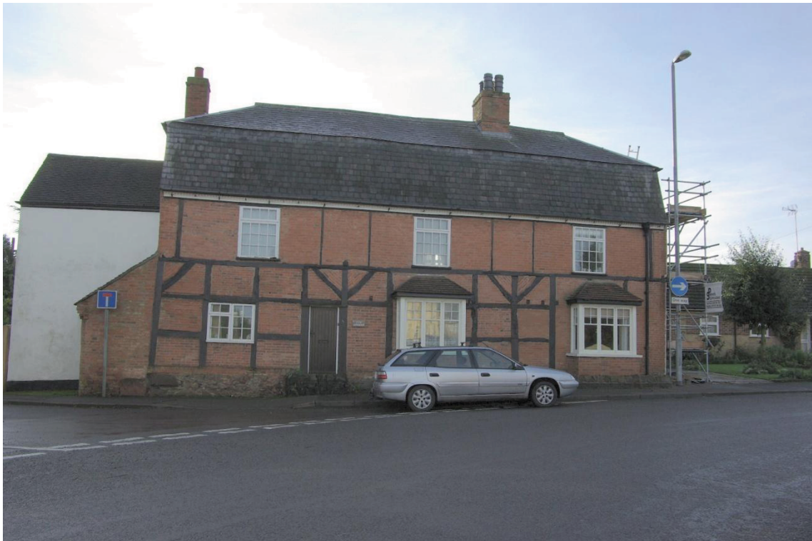
Figure 2 View Farmhouse, Front Elevation (Looking Southeast).