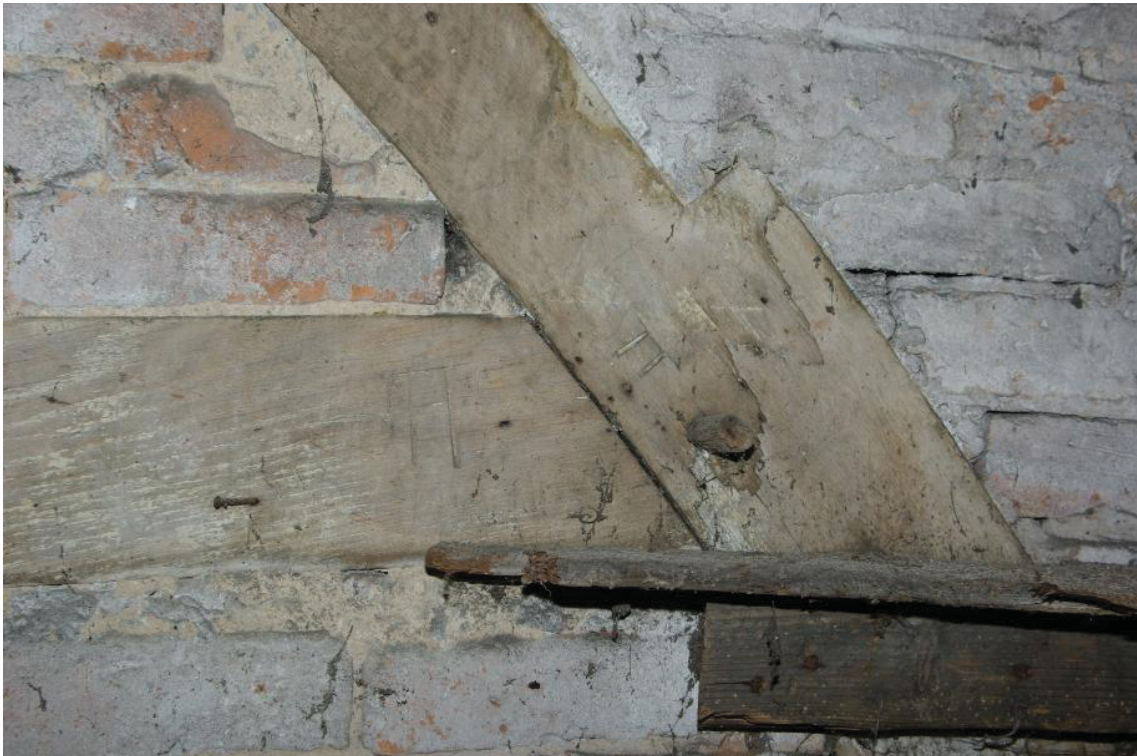
Figure 6 Detailed View of Carpenters Marks on Northern Roof Truss.