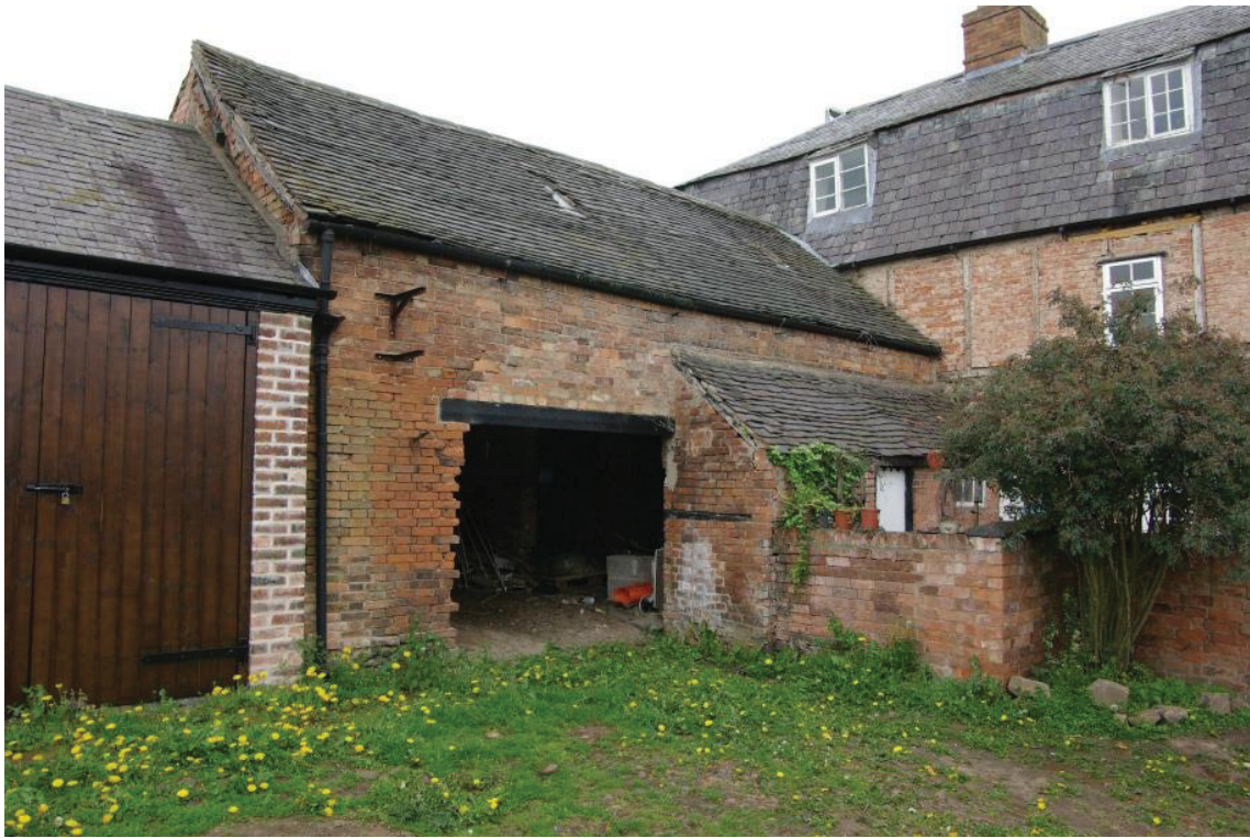
Figure 3 Front Elevation of Outbuilding (Looking North West).