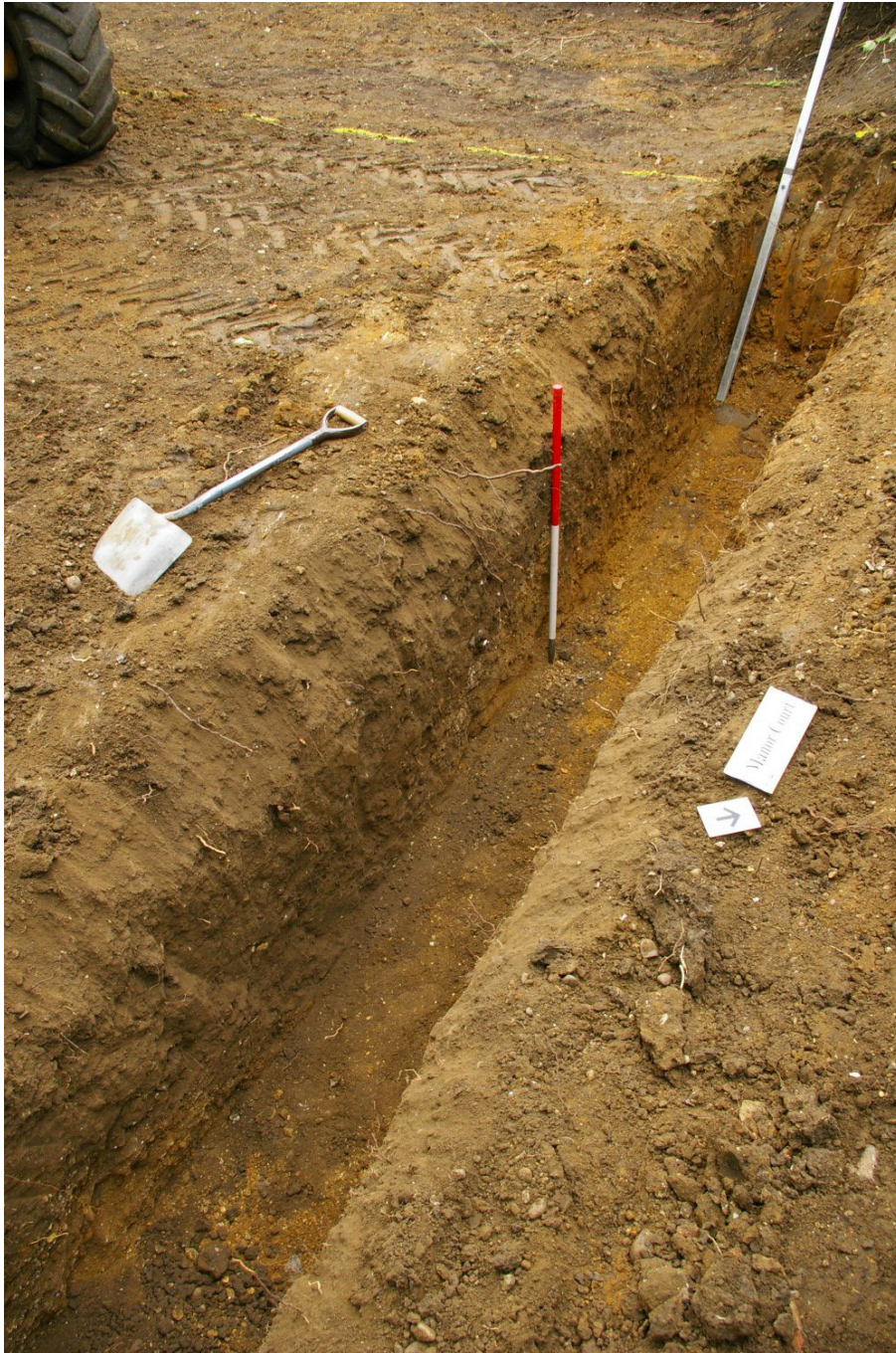
Figure 2 Backfilled Borrow Pit Visible in Northernmost Footing Trench.