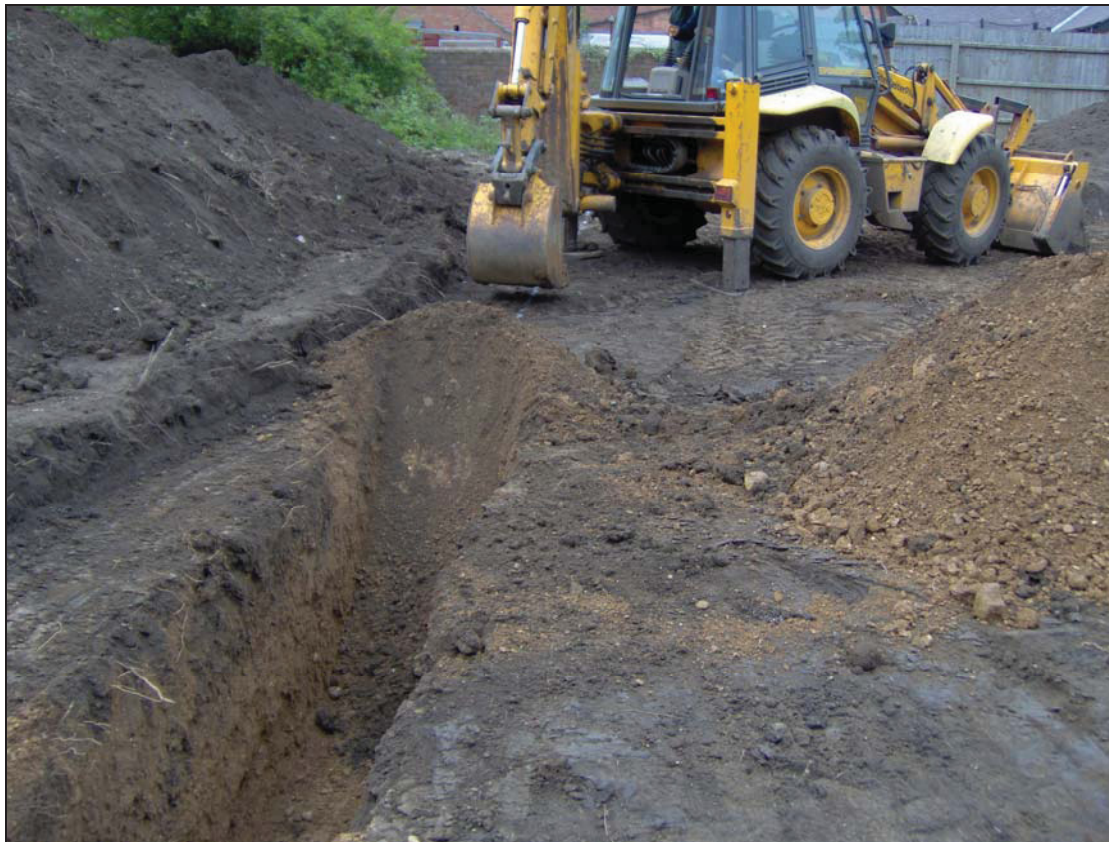
Figure 2. Machine excavation of foundation trench

5.1 The development footprint covered approximately 900 square metres. The house foundation trenches were excavated to depth of 1000mm and to a width of 600mm. This was done using a 600mm toothed bucket of a JCB excavator (Site Master). Only a 600mm width of natural was revealed within the width of the foundation trenches. This was light orange-brown in colour and of a silty clay consistency. The toothed bucket restricted the viewing of any archaeological features. However the sections were inspected, and because of the narrow width of the trenches, any linear or large discrete features, if present, should have been visible. Areas of the site had been disturbed by various brick/ concrete structures and also by an old diesel tank connected with the old farm which disturbed approximately 25 square metres of the area.