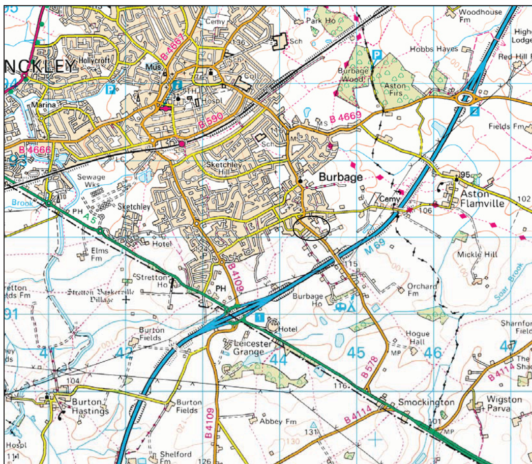
Figure 1: Location of site within Burbage village.

3.6 Two kilometres (1.25 miles) to the south-west of the site (and 0.5km south-west of Watling Street) lies the deserted medieval settlement of Stretton Baskerville. Previous Archaeological observations were undertaken by Warwickshire Museums Field Services at 55 Lutterworth Road to the North-West (Report 609 March 2006).